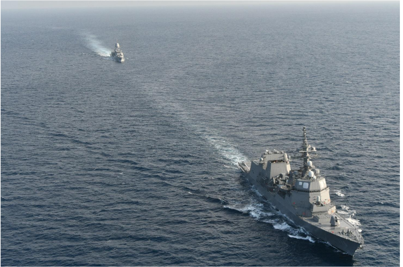
From the front, JS AKIZUKI , HMAS TOOWOOMBA