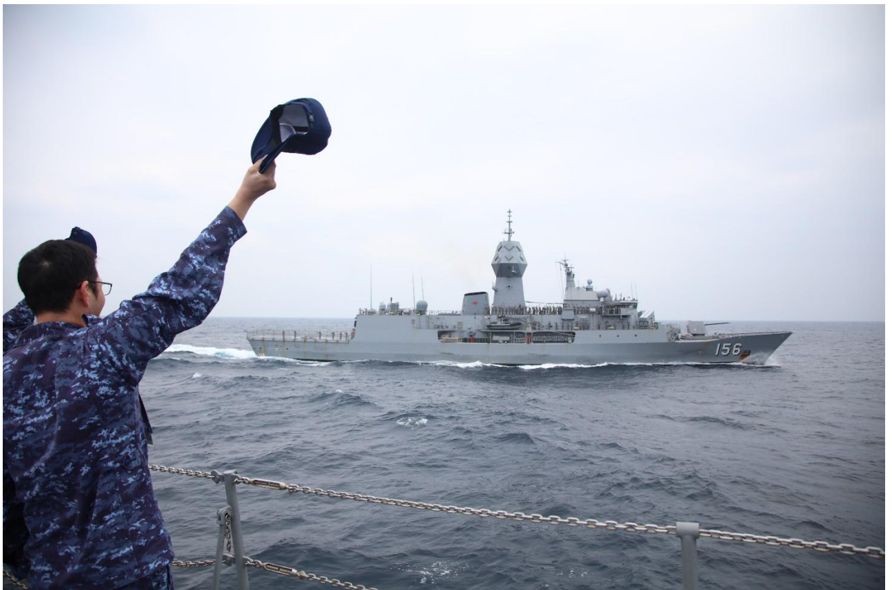
JMSDF members seeing off HMAS TOOWOOMBA