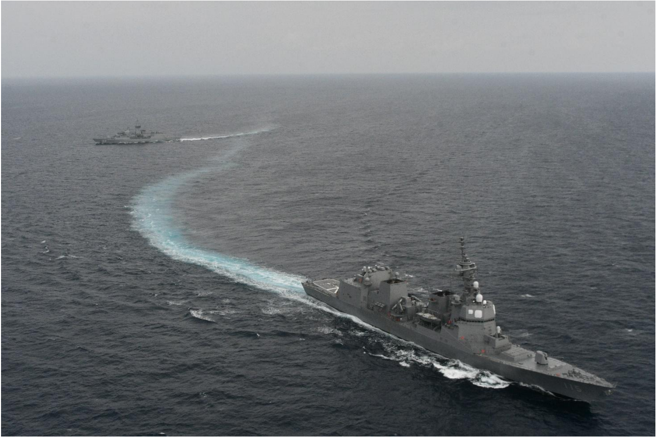
From the front, JS AKIZUKI , HMAS TOOWOOMBA