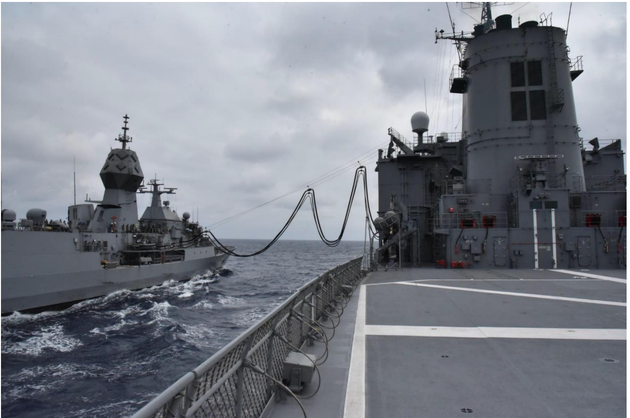
Replenishment at Sea