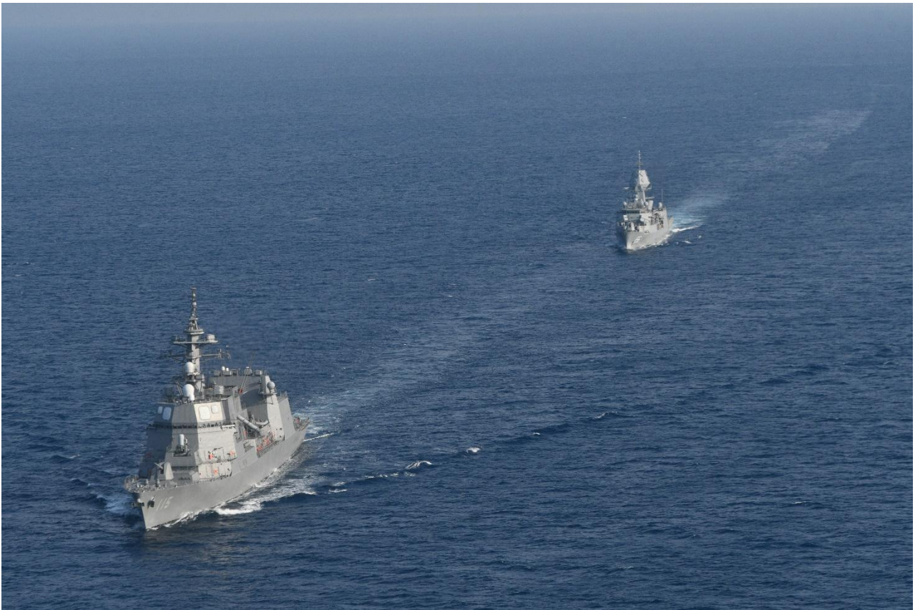
From the front, JS AKIZUKI , HMAS TOOWOOMBA