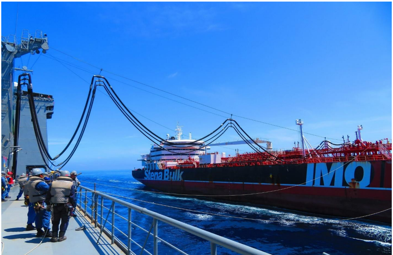
Replenishment at Sea