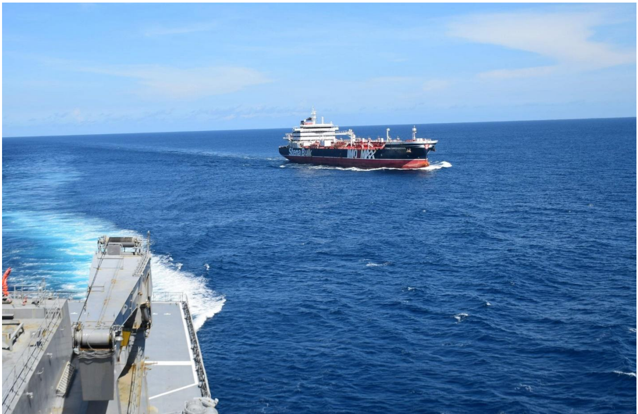
From the front JS OUMI, MT STENA IMPERATIVE