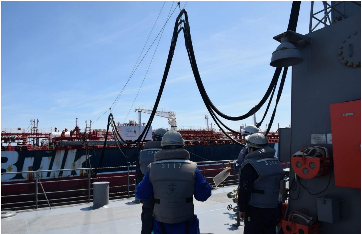
Replenishment at Sea