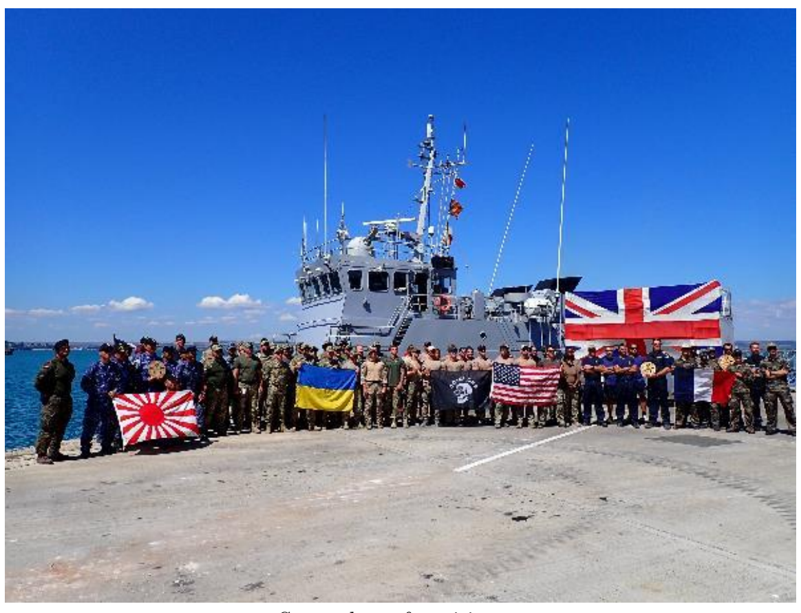
Group photo of participants