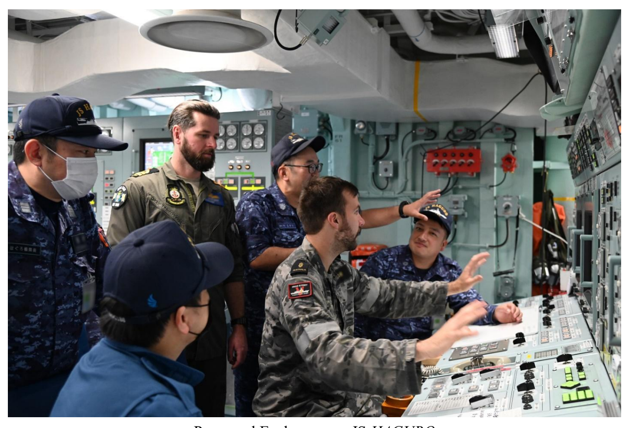
Personnel Exchanges on JS \it HAGURO