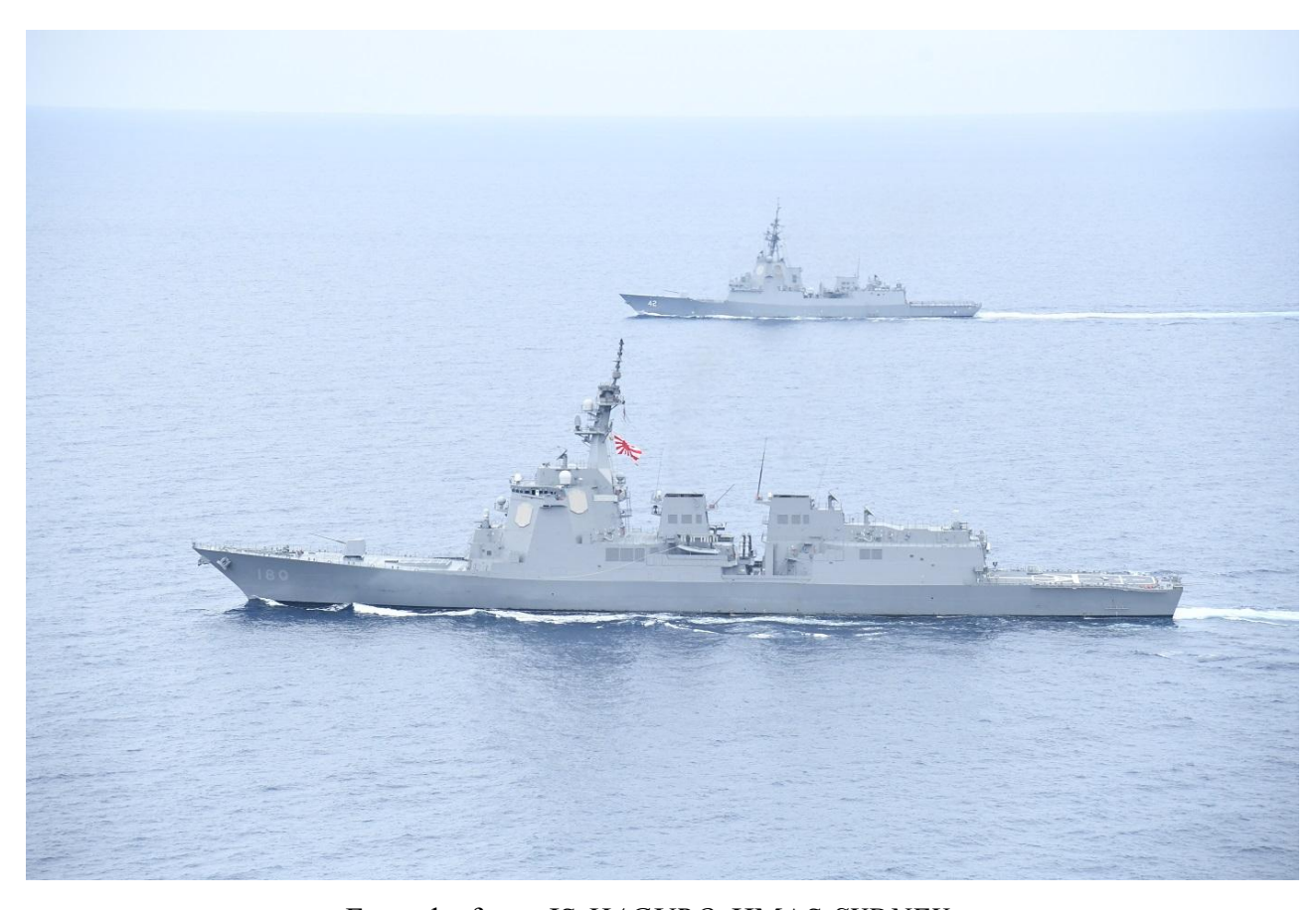
From the front, JS HAGURO, HMAS SYDNEY