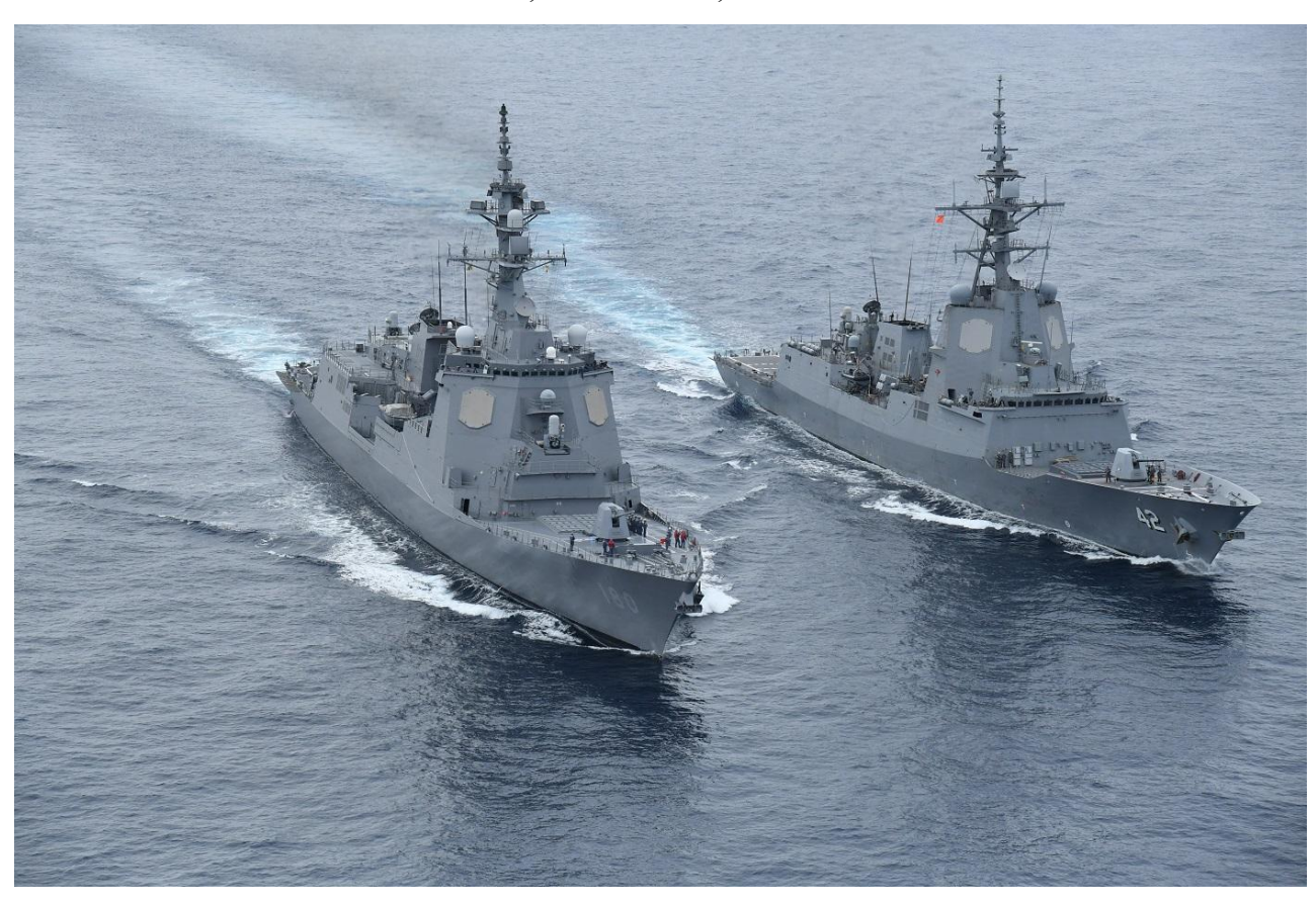
From the left, JS \it HAGURO , HMAS \it SYDNEY