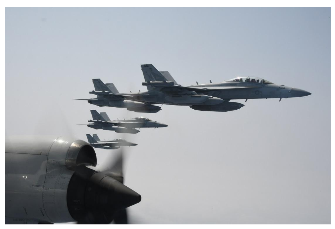
PHOTEX (UP-3D and USN EA-18G)