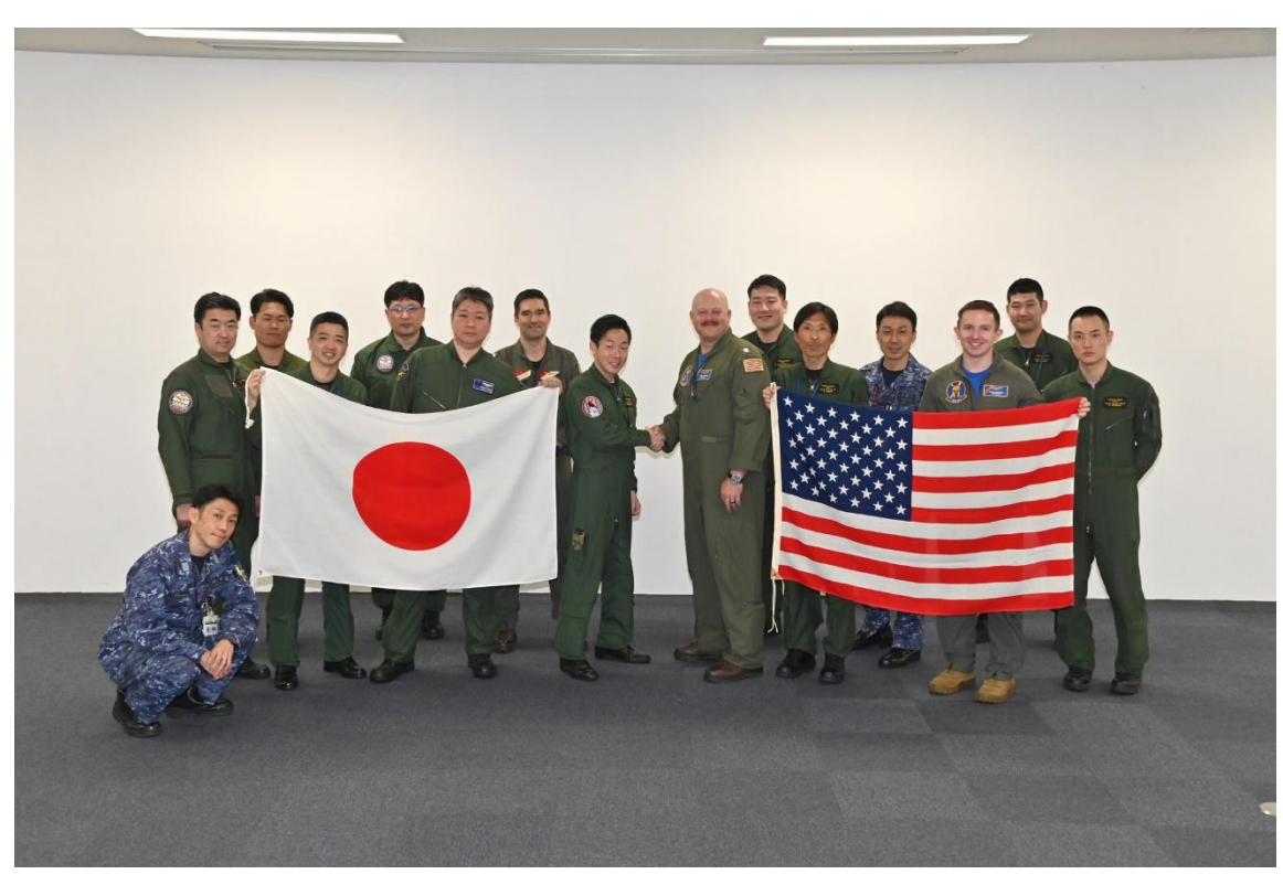
Group photo (the participants of the Japan- U.S. Bilateral Exercise)