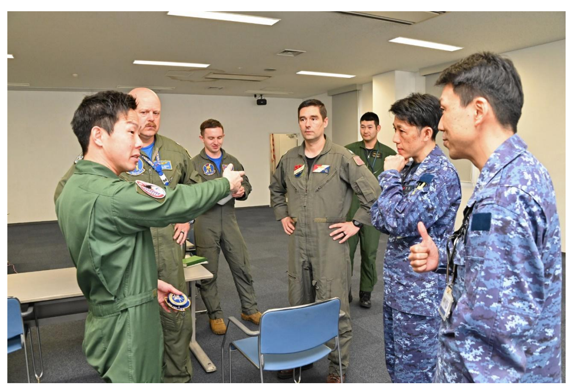
Briefing before the Exercise