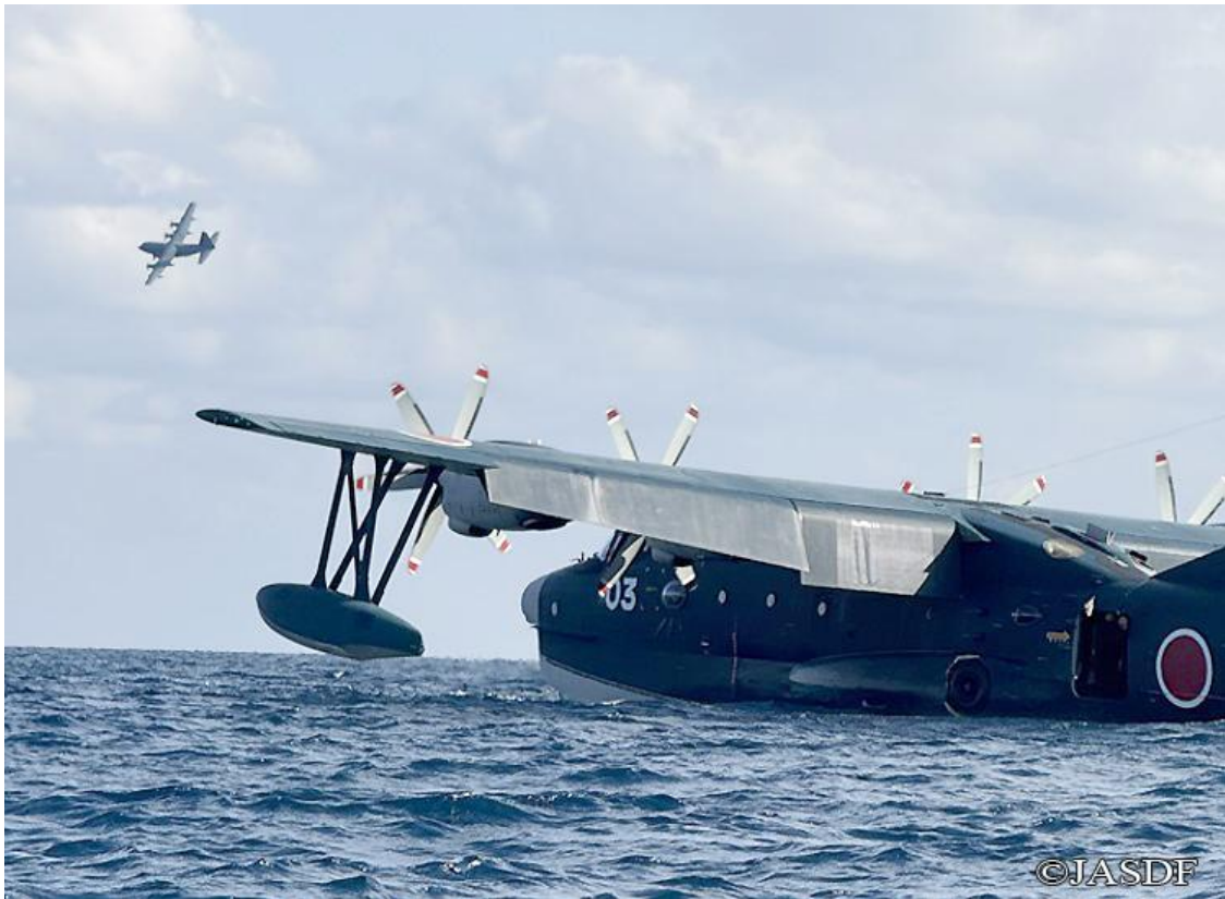
US-2 and MC-130J