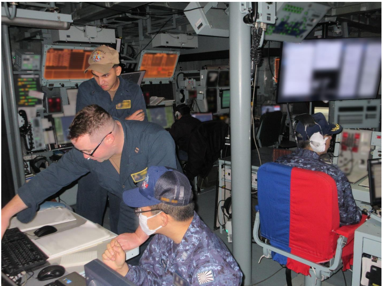
JMSDF and U.S. Navy members conducting training