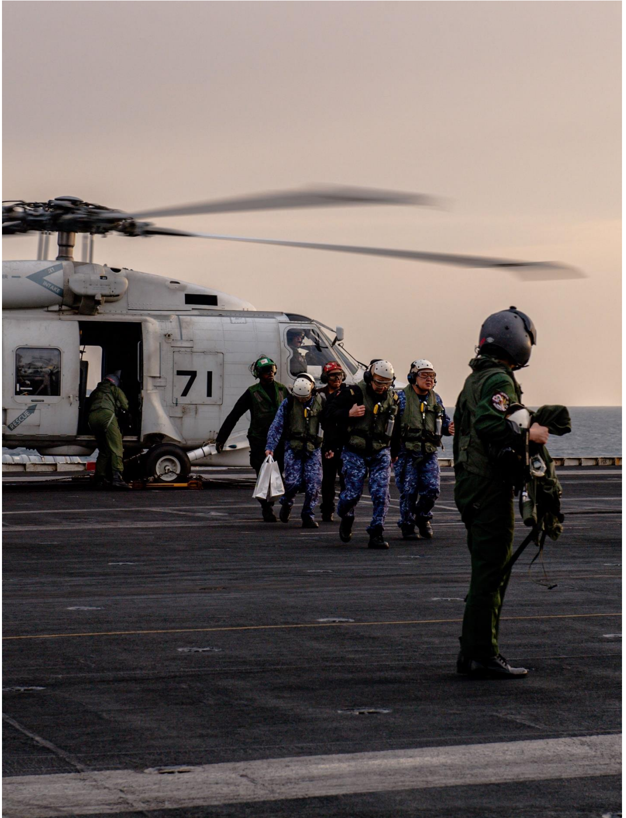
SH-60K landing on USS THEODORE ROOSEVELT