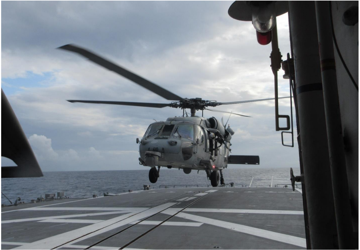
USN HELO landing on JS ARIAKE