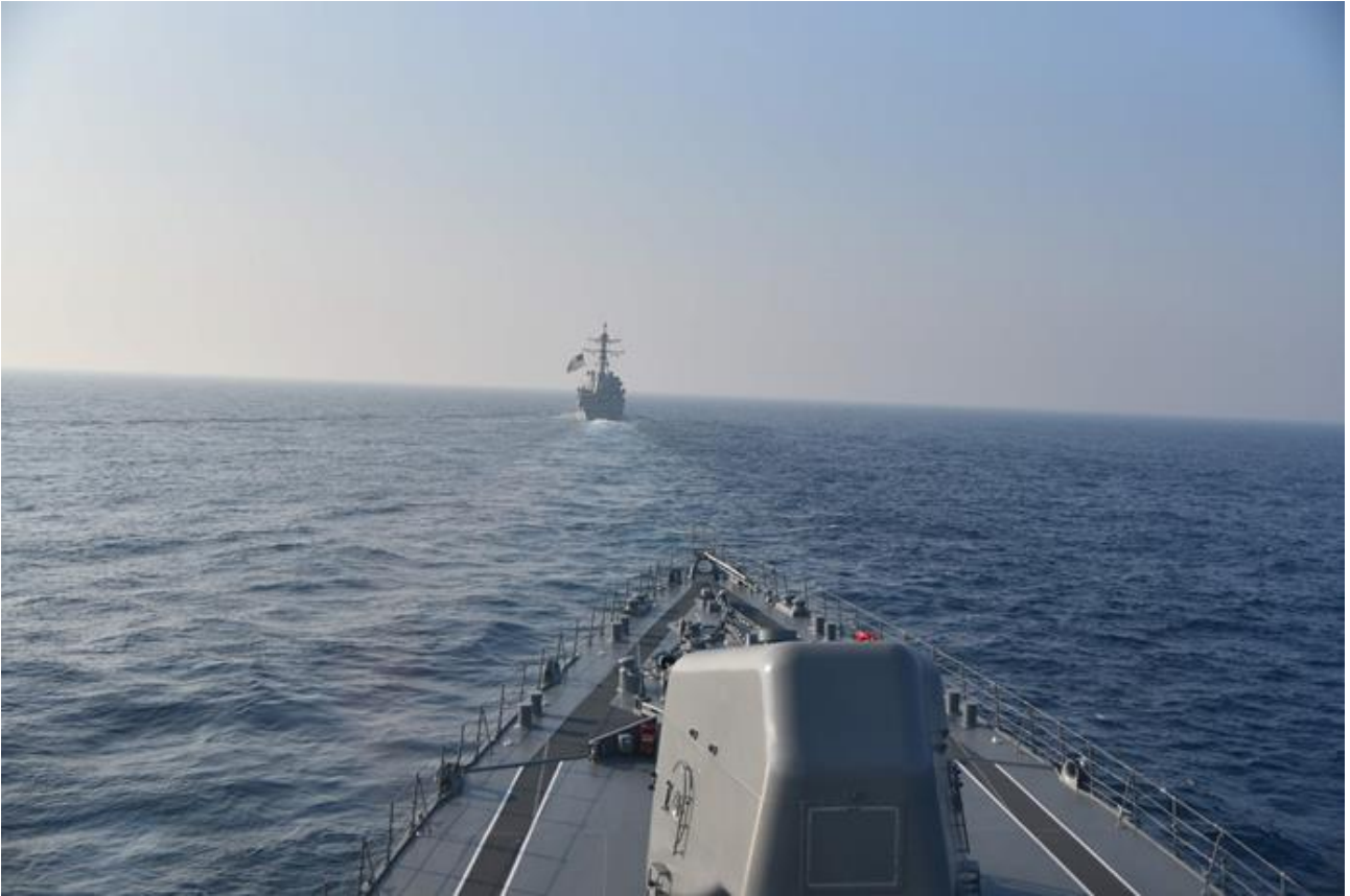
From the front, USS HALSEY and JS SAZANAMI