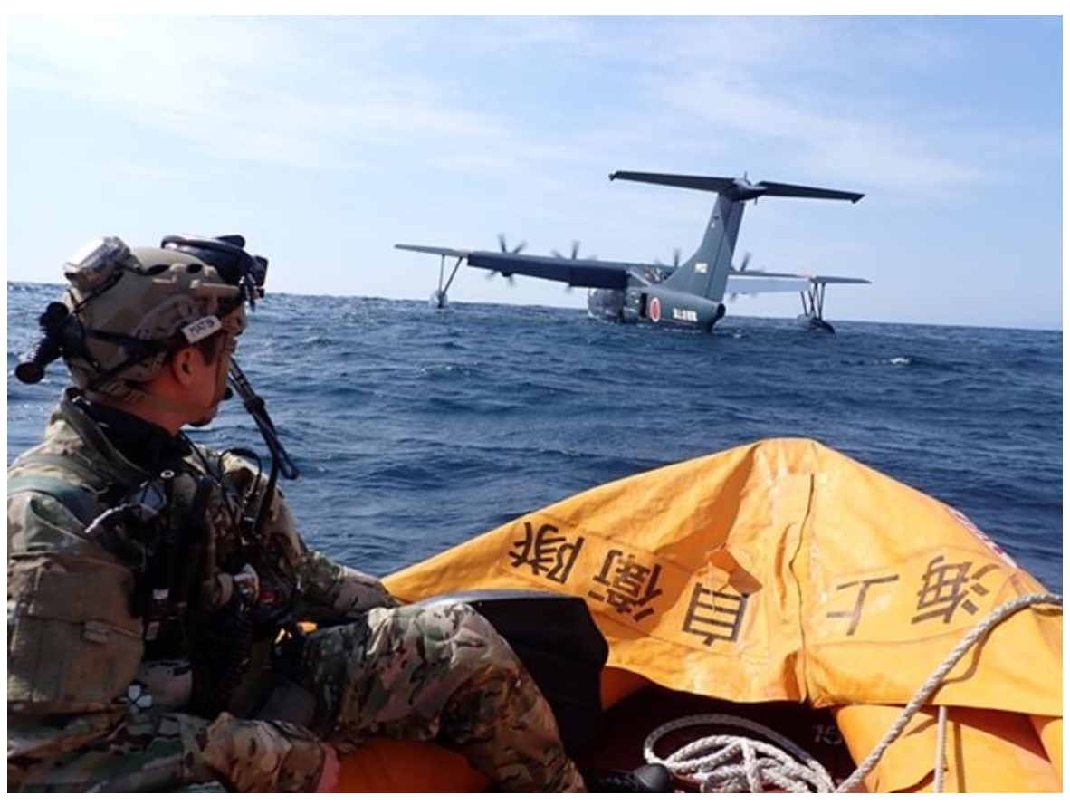
Search and Rescue exercise