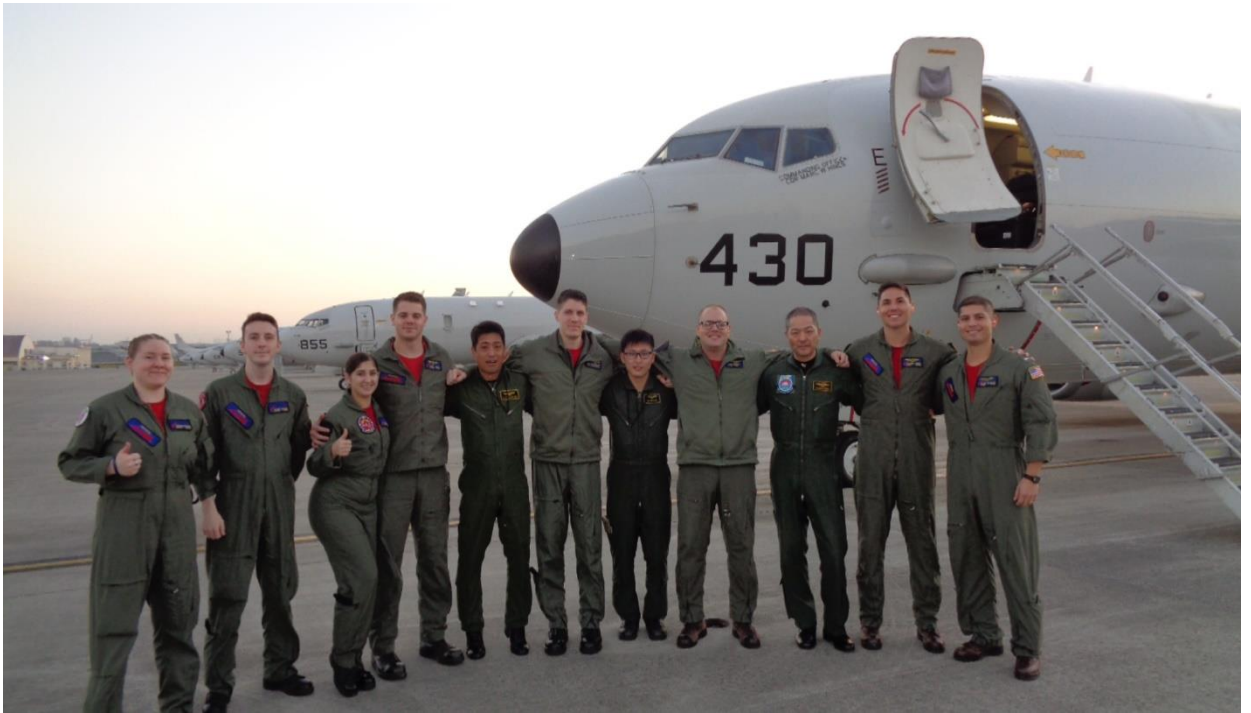
Japanese and U.S. crews