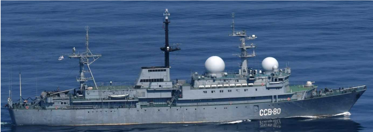
Balzam-class AGI (hull number 80)