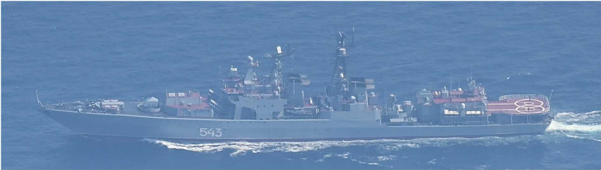
Udaloy-III-class DD (hull number 543)