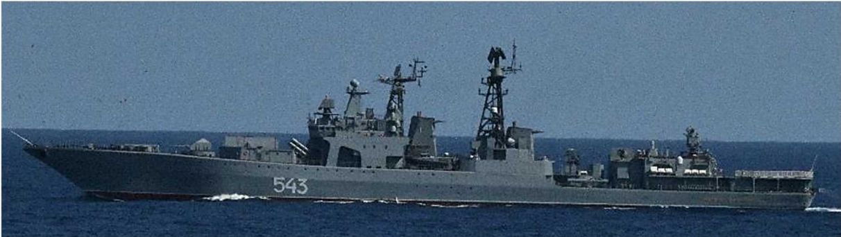
Udaloy-III-class DD (hull number 543)