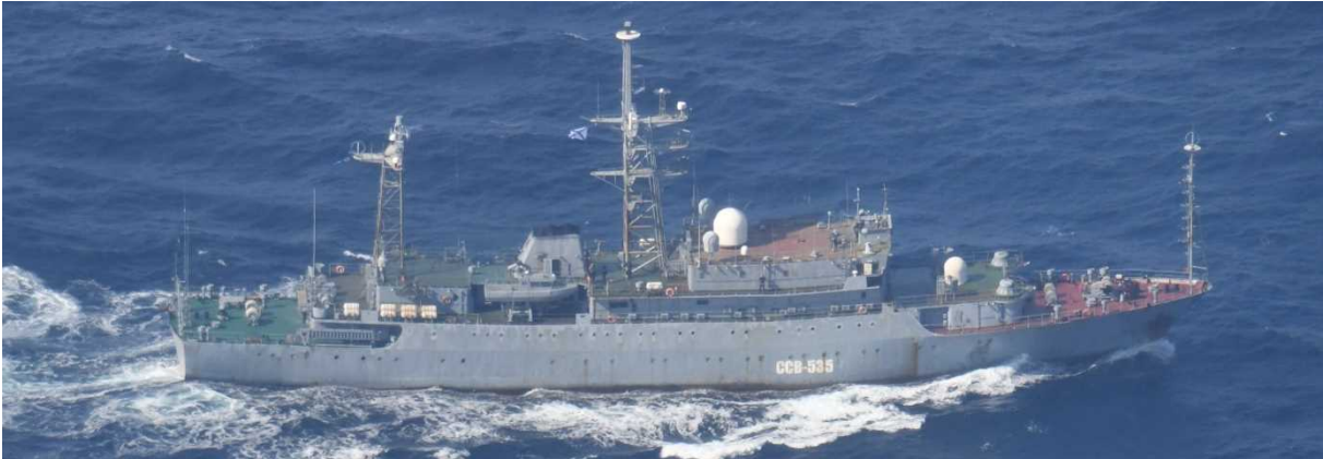
Vishnya-class AGI (hull number 535)