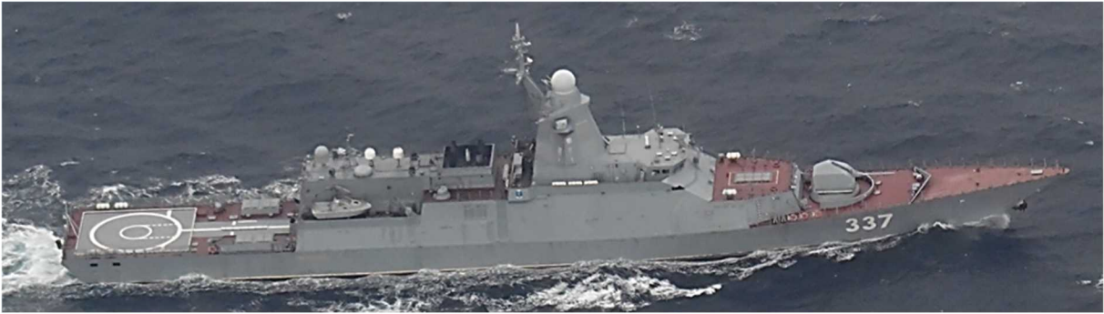
Steregushchiy-III-class FFG (hull number 337)