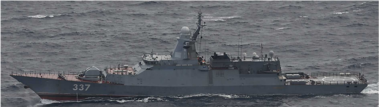
Steregushchiy-III-class FFG (hull number 337)