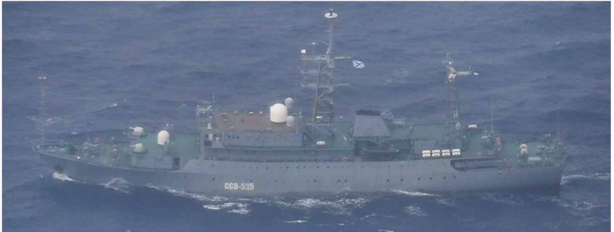
Vishnya-class AGI (hull number 535)