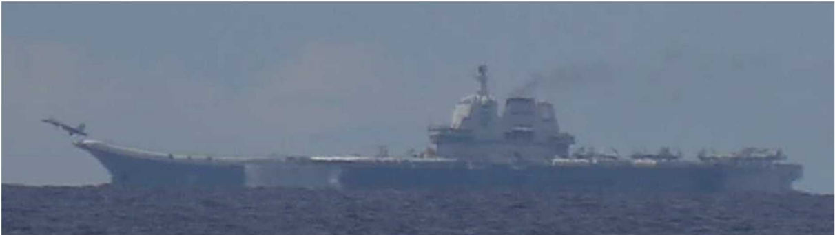
Kuznetsov-class CV "Shandong" (hull number 17)