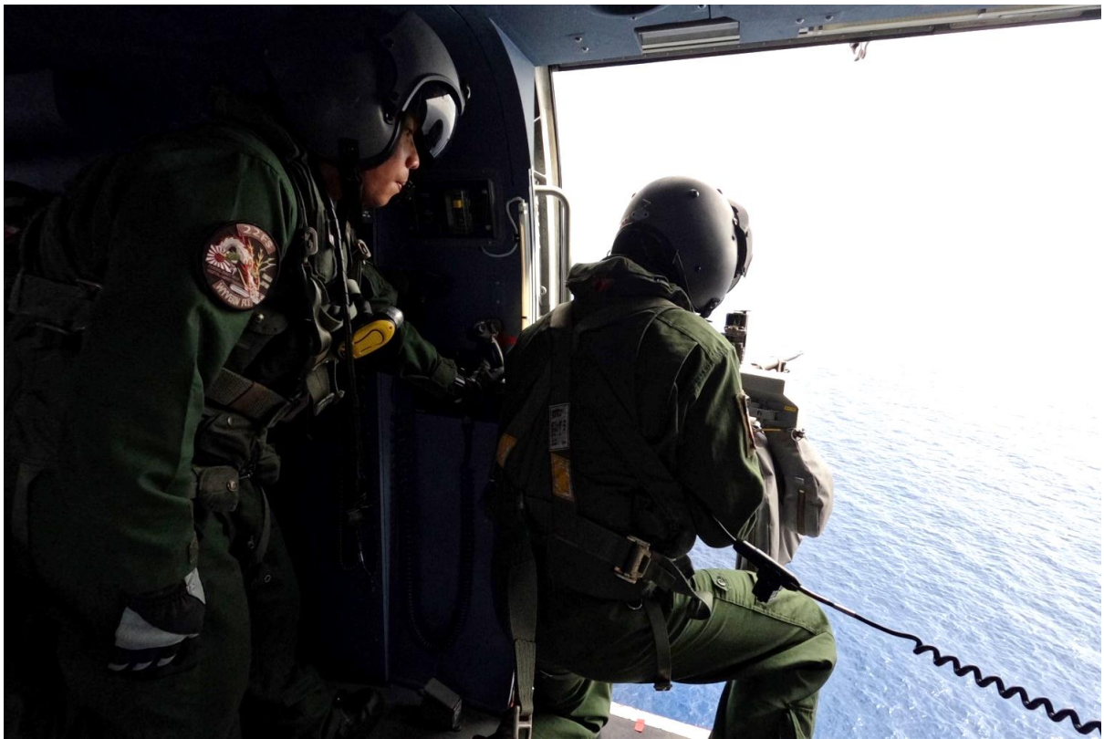
A scene from an Anti-Piracy drill