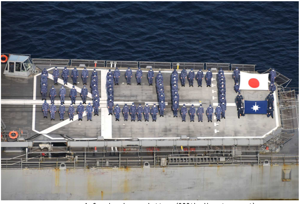
A forming human letter (900th direct escort)