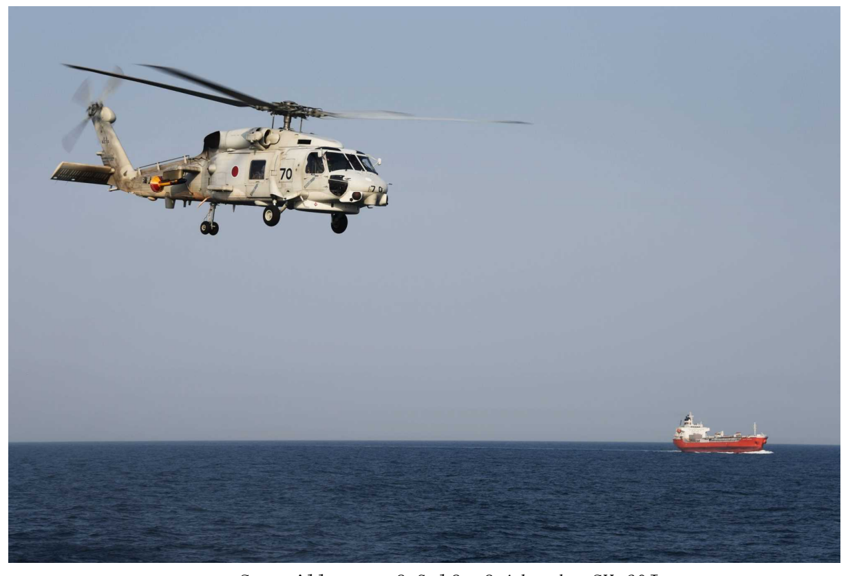
Surveillance of Gulf of Aden by SH-60J