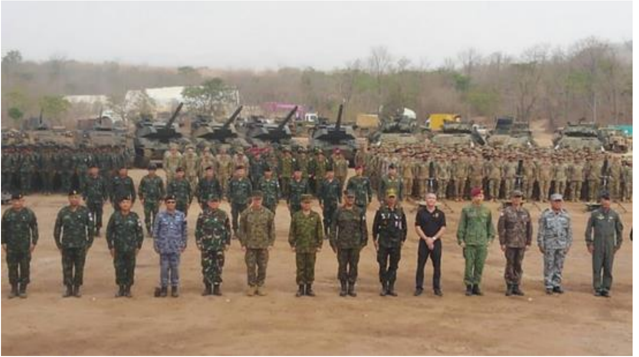
Visit to Cobra Gold 2020