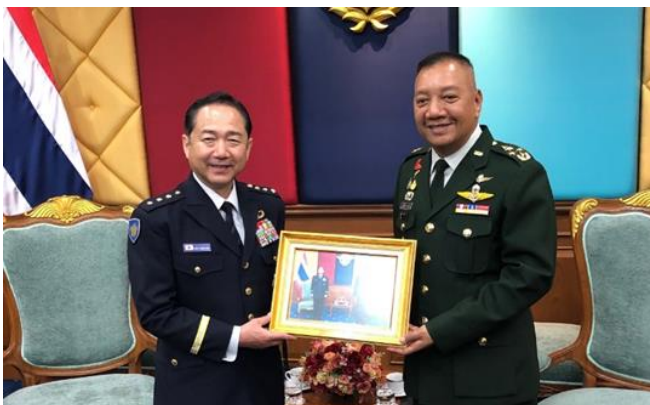
Meeting with Chief of Defence Forces

General Yamazaki also observed multilateral exercise Cobra Gold 2020, participated in its closing ceremony, and stressed Japan's strong commitment to Cobra Gold which is the largest multilateral exercise in Southeast Asia as well as to maintaining stability in the regional security.