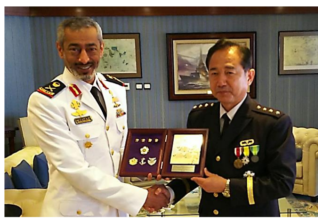
Meeting with Commander of the UAE Naval Forces

Meeting with Deputy Commander of the UAE Land Forces