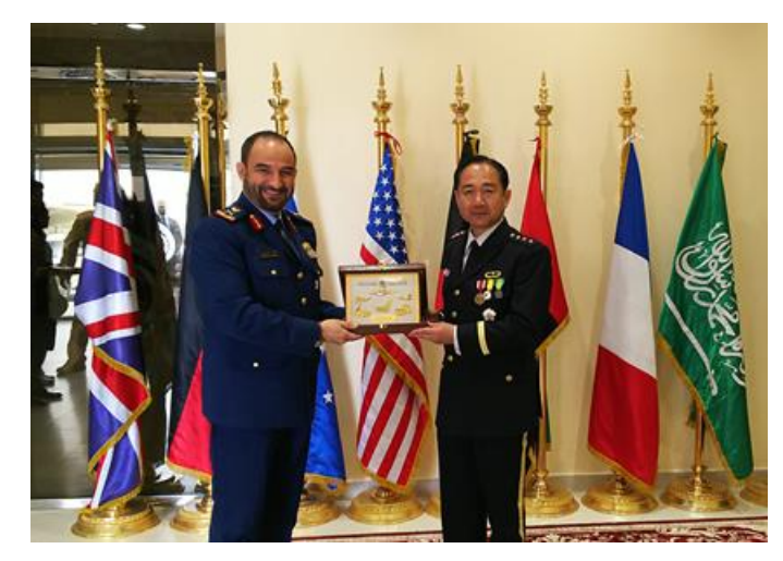
Meeting with Deputy Commander of the UAE Air Force and Air Defense