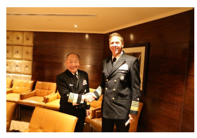
JPN-US bilateral meeting