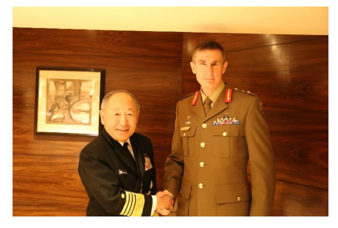
JPN-AUS bilateral meeting