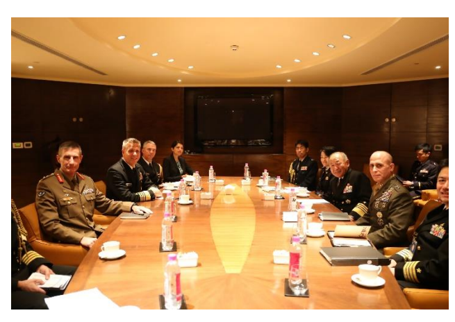
JPN-US-AUS trilateral meeting