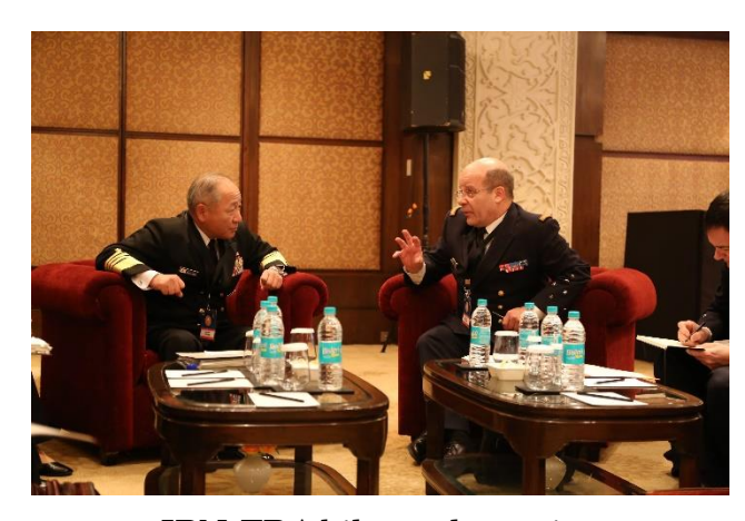
JPN-FRA bilateral meeting