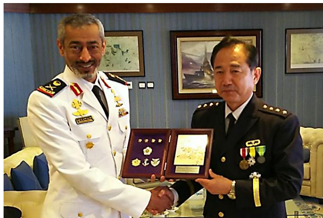
Meeting with Commander of the UAE Naval Forces