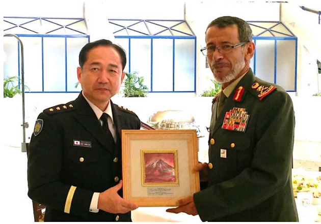
Meeting with Chief of Staff of the UAE Armed Forces.