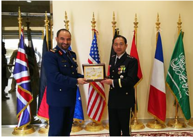
Meeting with Deputy Commander of the UAE Air Force and Air Defense