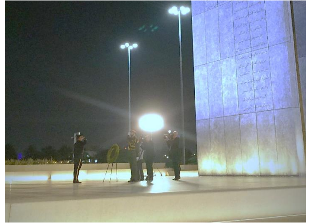
Floral Tribute at Wahat Al Karama