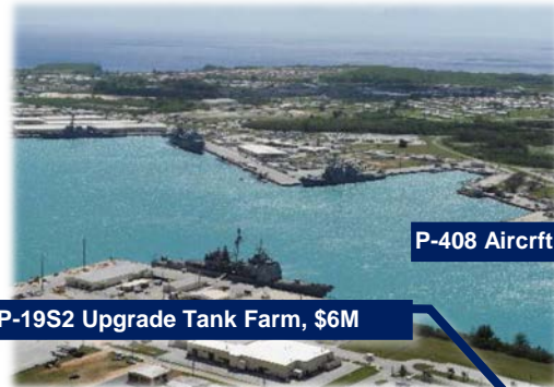
P-19S2 Upgrade Tank Farm, $6M