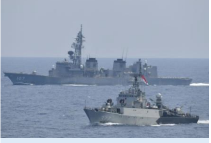
Japan-Indonesia goodwill exercise during IPD (Oct 2020)