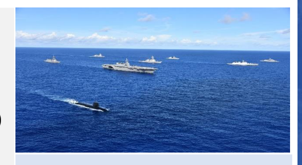
Exercise Malabar (Nov 2020)