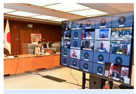
JPIDD (online) (Sep 2021)