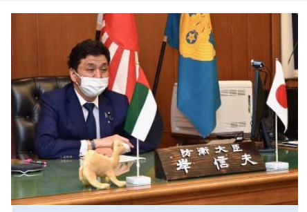
Japan-UAE Defense Ministers' VTC (Mar 2021)