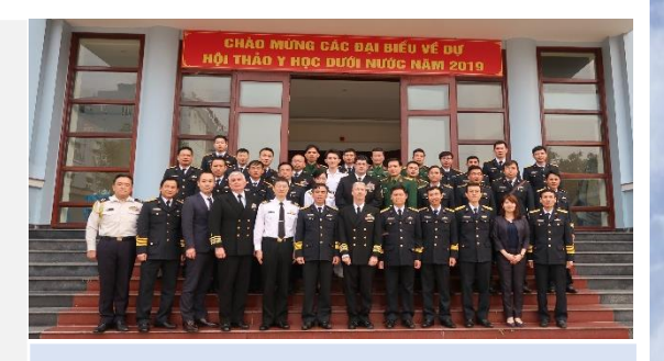
Japan-U.S. joint capacity building with Vietnam (Mar 2019)