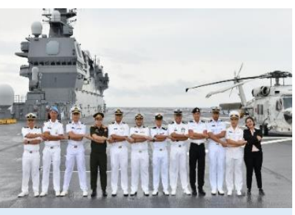
3rd Japan-ASEAN Ship Rider Cooperation Program (Jun 2019)