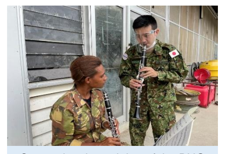
Supporting the training of the PNG military band (Sep 2021)