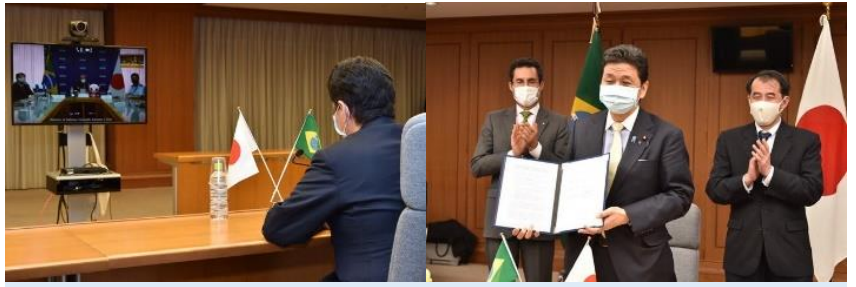
Japan-Brazil Defense Ministers' Video Teleconference and the Signing Ceremony of the Memorandum on Defense Cooperation and Exchanges (Dec 2020)

Signed the Memorandum on Defense Cooperation and Exchanges with Brazil, adding to similar memorandum with Colombia