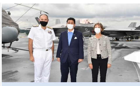
Defense Minister KISHI's visit to the UK aircraft carrier HMS "Queen Elizabeth" during a port visit in Japan (Sep 2021)