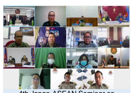
4th Japan-ASEAN Seminar on HA/DR (Online) (Apr 2021)