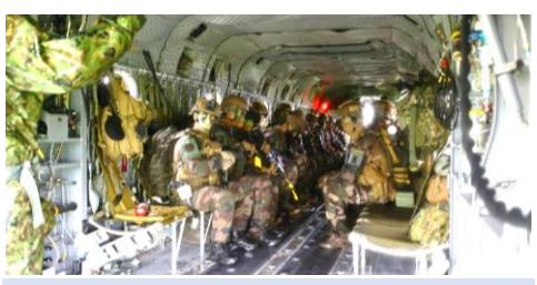
ARC21 (May 2021)