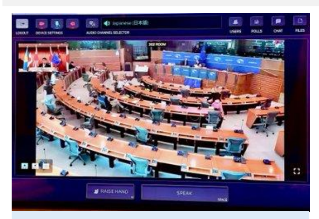
Defense Minister KISHI delivered a speech at the European Parliament (virtual format) (Jun 2021)