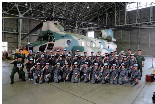
SDF Life Experience Tour for Women

The MOD/SDF offers SDF Life Experience Tours for