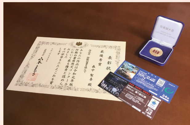
Honorable certificate and extra prize for the first award winner