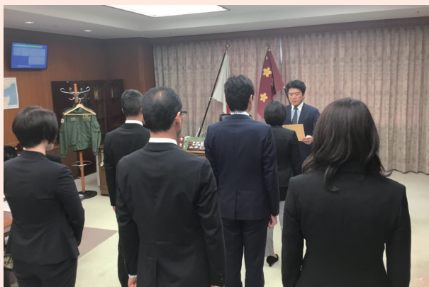
Commendation ceremony for the essay competition