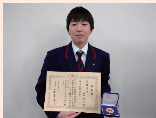
Recent photo of the author