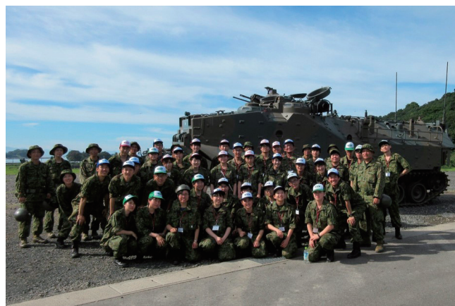
Summer Tour for College Students