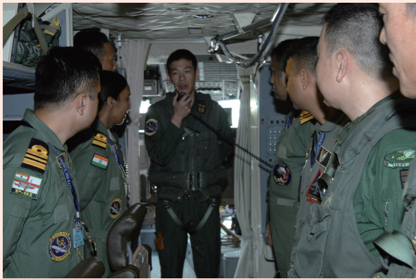
The author explaining precautions to the personnel of the U.S. Navy and the Indian Navy on board a P-1

As a captain of MSDF P-1, I participated in the Japan-U.S.-India trilateral exercise “Malabar 2019” (patrol aircraft units) held at Atsugi Air Base in September 2019. This was the 8th Malabar held with the participation of Japan and the 3rd Malabar as a Japan-U.S.-India trilateral exercise, but it was the first time that state-of-the-art patrol aircraft—P-1 of the MSDF, P-8A of the U.S. Navy and P-8I of the Indian Navy—lined up at Atsugi Air Base.