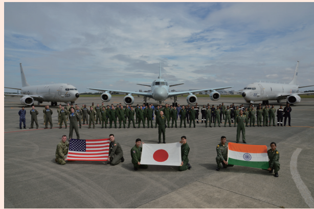
MSDF P-1 (center), P-8A of the U.S. Navy (left), P-8I of Indian Navy and crew members

The main focus of “Malabar 2019” was to conduct anti-submarine training together. The training convinced me of the U.S. Navy and the Indian Navy crew’s high degree of expertise and that they are reliable partners. We were also able to cultivate great friendship with each other by going through the rigorous training together. I believe that the trusting relationship built through the exercise is not only a valuable experience for me as a pilot but also conducive to security cooperation between the three countries and directly contributes to the realization of a “Free and Open Indo-Pacific.”