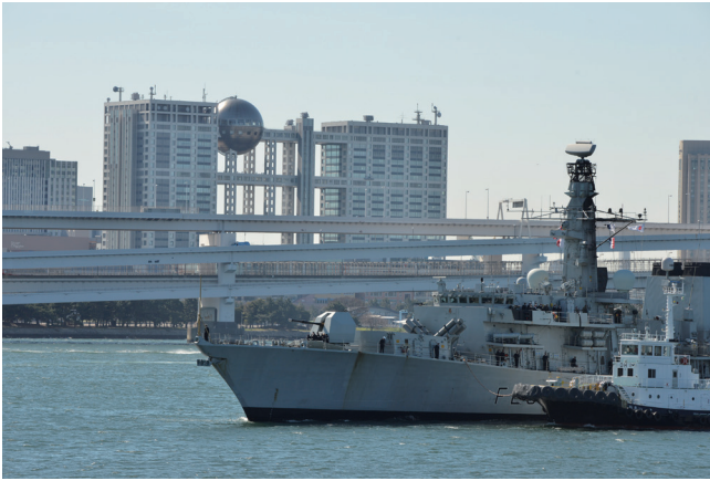
HMS “Montrose” (U.K.), which came to Japan to monitor illegal ship-to-ship transfer

mobility, in view of dealing with threats such as terrorism and cyber security. 4