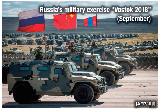
The exercise was conducted on the largest scale since 1981, with participation of nearly 300,000 soldiers, including those from the Chinese and Mongolian militaries