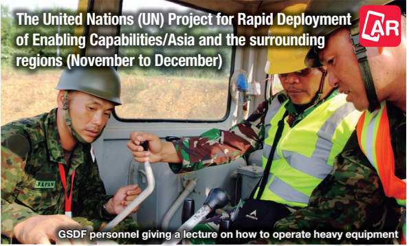
While the SDF had already been conducting the UN Project for Rapid Deployment of Enabling Capabilities in Africa, it carried out the project in Asia and the surrounding regions for the first time.