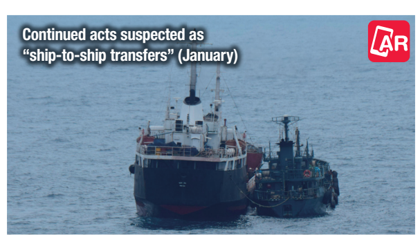
Acts suspected as "ship-to-ship transfers" were confirmed 20 times in total from 2018 to the end of June 2019.