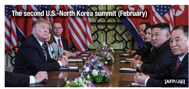
The second U.S.-North Korea summit was held in Hanoi, but ended without reaching any agreement.