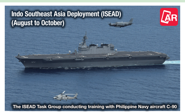
Toward realizing a "free and open Indo-Pacific," the SDF conducted joint training with the navies of the countries in the region and reinforced cooperation with them.