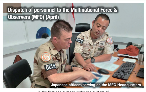
In the first deployment under the system of "Internationally Coordinated Operations for Peace and Security," personnel began to be dispatched as staff officers to the MFO.