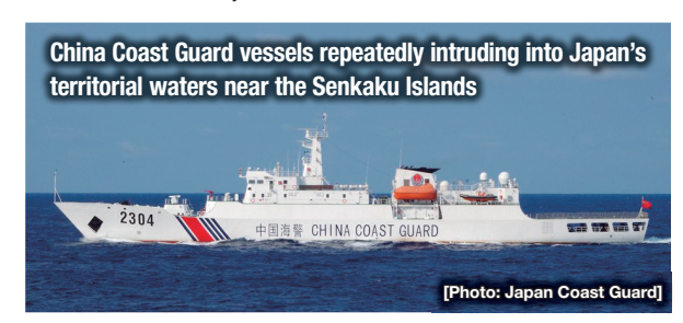
Chinese government vessels have continuously intruded into Japan's territorial waters near the Senkaku Islands in spite of Japan's strong protests.