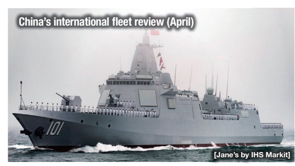
China, which aims to beef up its military capacity, unveiled its new 10,000-ton class Renhai-class destroyer at an international fleet review.