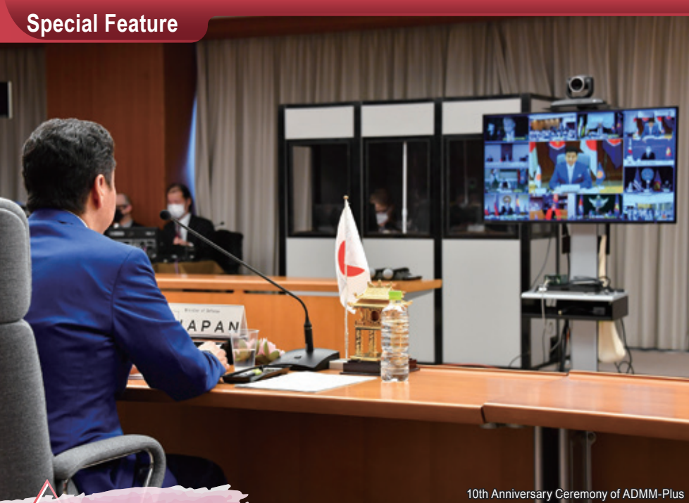
10th Anniversary Ceremony of ADMM-Plus