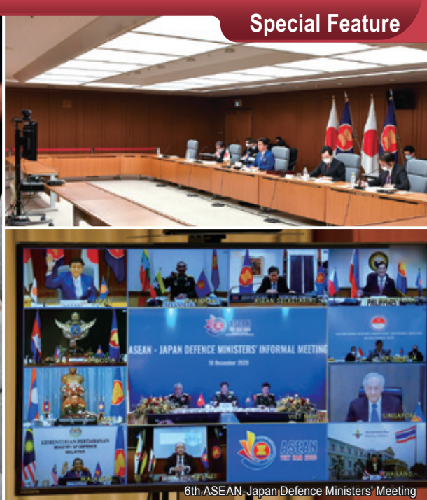
6th ASEAN-Japan Defence Ministers' Meeting