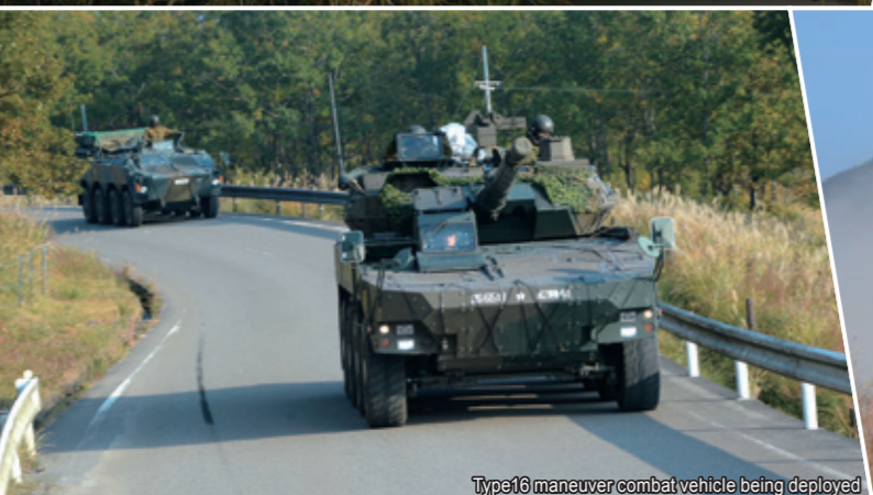
Type 16 maneuver combat vehicle being deployed