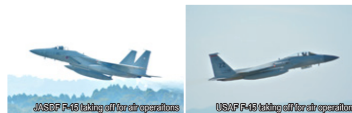
JASDF F-15 taking off for air operations