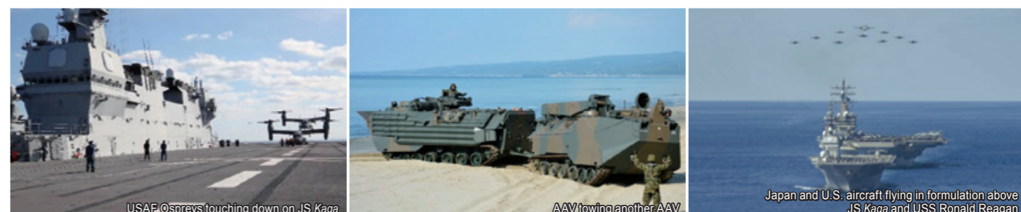
USAF Ospreys touching down on JS Kaga