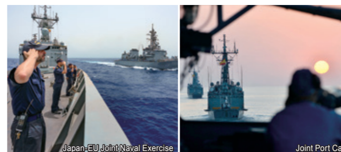
Japan-EU Joint Naval Exercise

Japan and the EU are committed to upholding the rules-based international order through practical maritime cooperation, including cooperation on freedom of navigation and overflight, to secure sea-lanes of communication and to protect the global maritime domain against all types of threat, traditional and non-traditional. Japan and the EU are determined to pursue and enhance their cooperation on freedom of navigation and maritime security through future training initiatives and operational activities at sea. Furthermore, they stand ready to extend their lasting cooperation in this area so as to include also other partners in the Indian Ocean and in the Pacific region.