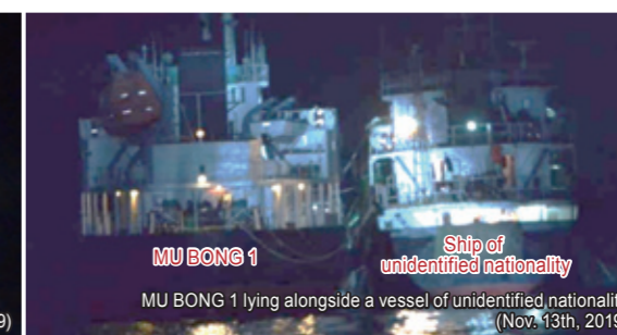
MU BONG 1 lying alongside a vessel of unidentified nationality (Nov. 13th, 2019)