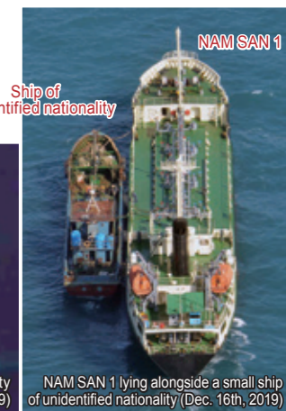
NAM SAN 1 lying alongside a small ship of unidentified nationality (Dec. 16th, 2019)