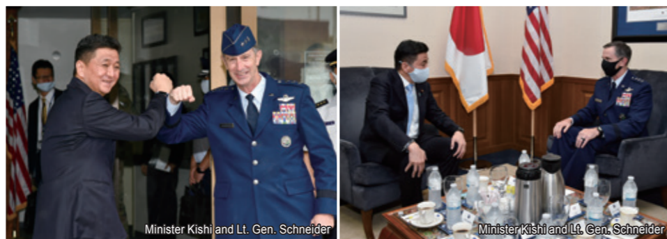
Minister Kishi and Lt. Gen. Schneider

They also exchanged views on the regional security environment surrounding Japan, realignment of the U.S. Forces and various challenges concerning the USFJ.