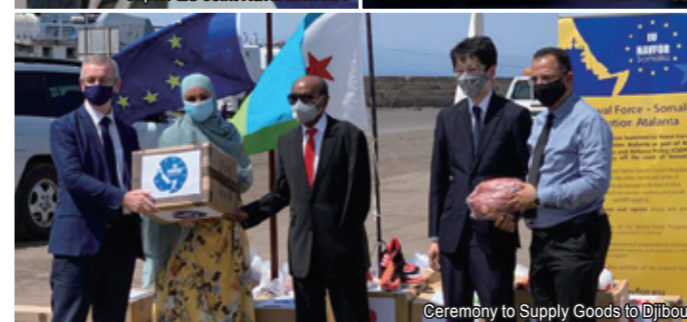
Ceremony to Supply Goods to Djibouti