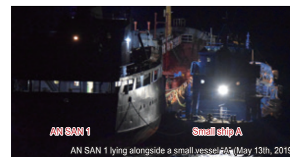
AN SAN 1 lying alongside a small vessel "A" (May 13th, 2019)

The Japan Maritime Self-Defense Force (JMSDF) has also been conducting information gathering activities for vessels suspected to be in violation of the UNSCRs, and Japan will work closely with related countries.