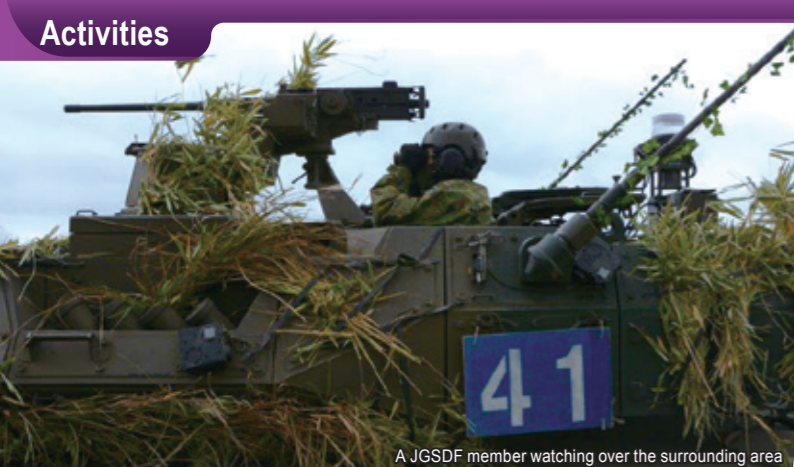
A JGSDF member watching over the surrounding area