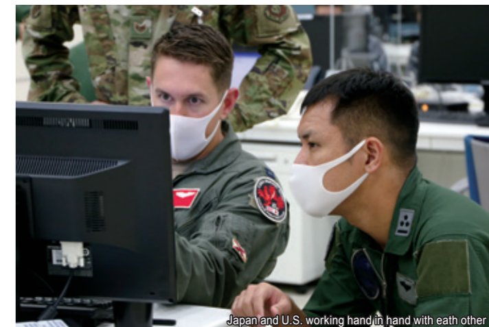
Japan and U.S. working hand in hand with each other