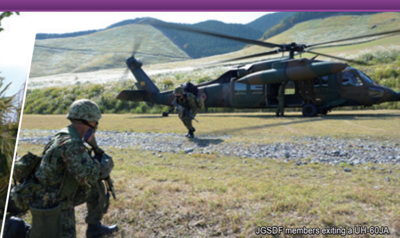
JGSDF members exiting a UH-60JA