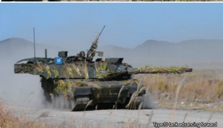
Type 10 tank advancing forward