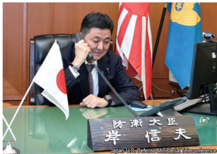
Japan-U.S. Defense Ministerial Teleconference

After his inaugural greeting, Minister Kishi expressed his resolve to strengthen the Japan-U.S. Alliance. Secretary Esper offered his congratulations on Minister Kishi's appointment to the office.