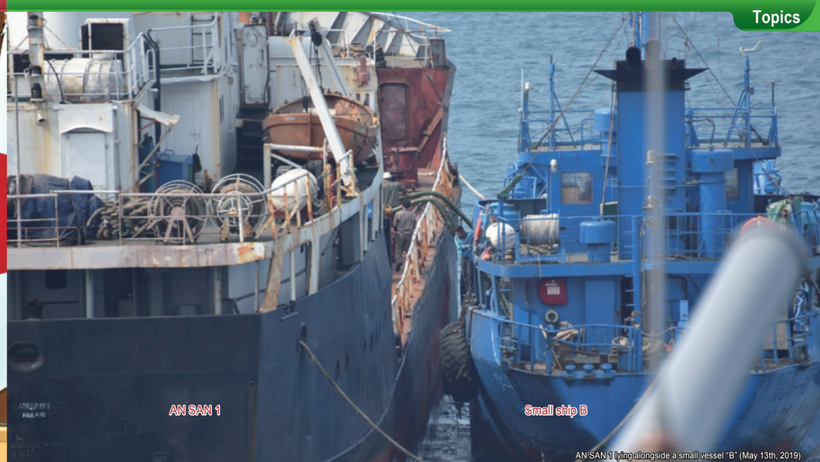
AN SAN 1 lying alongside a small vessel "B" (May 13th, 2019)