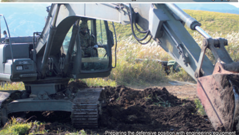
Preparing the defensive position with engineering equipment