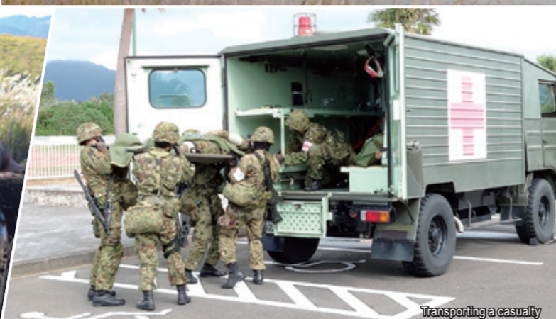
Transporting a casualty