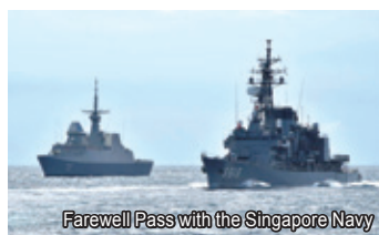
Farewell Pass with the Singapore Navy