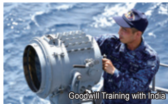
Goodwill Training with India