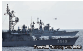
Goodwill Training with India