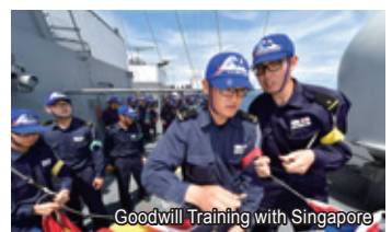
Goodwill Training with Singapore