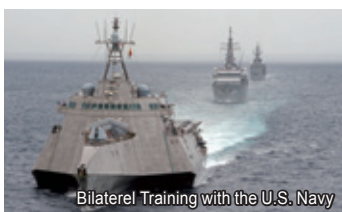
Bilateral Training with the U.S. Navy

another goodwill training for tactical maneuver and communications training with the Indian Navy's destroyer INS Rana and the corvette INS Kulish in the Indian Ocean. Through this training, they promoted mutual understanding and a relationship of trust with the Indian Navy.