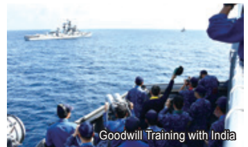
Goodwill Training with India