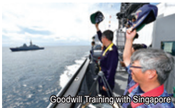
Goodwill Training with Singapore