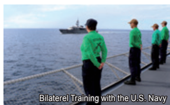
Bilateral Training with the U.S. Navy