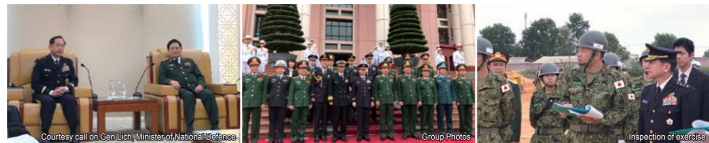
Courtesy call on Gen Lich, Minister of National Defence

exchanged views on the security environment surrounding the two countries and agreed to promote defense cooperation and exchanges to contribute to the promotion of the Joint Vision Statement on Japan-Vietnam Relations.