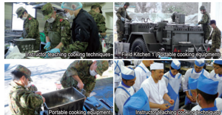
Instructor teaching cooking techniques