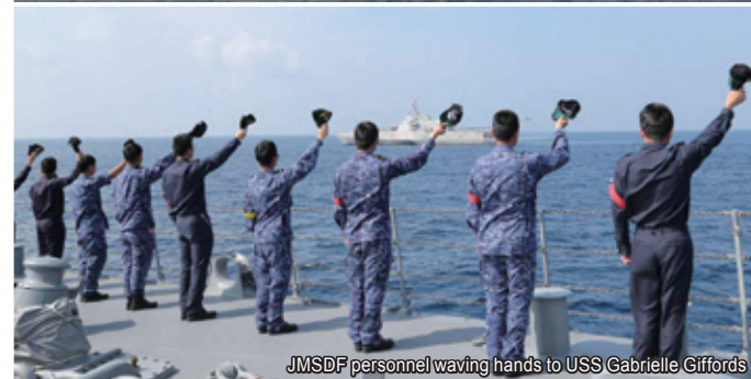
JMSDF personnel waving hands to USS Gabrielle Giffords