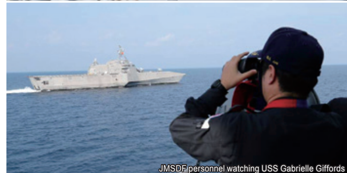
JMSDF personnel watching USS Gabrielle Giffords