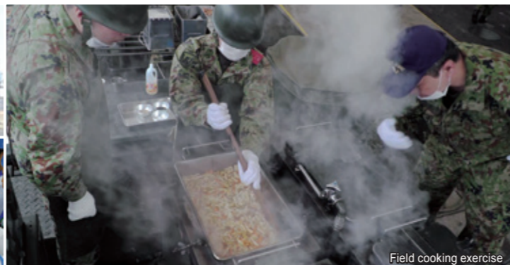
Field cooking exercise