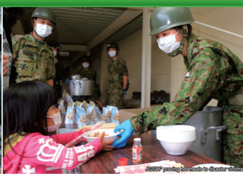
JGSDF providing hot meals to disaster victims