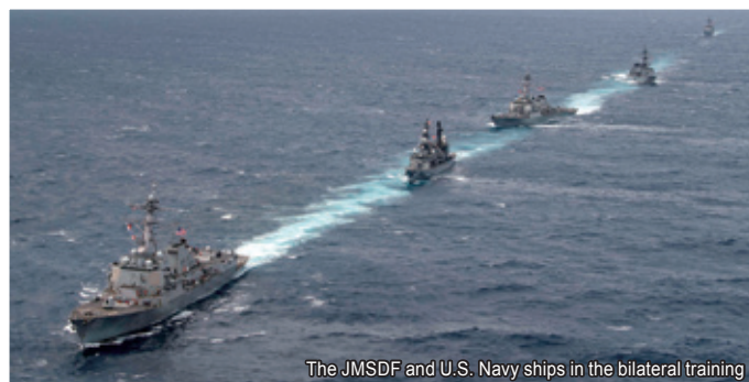
The JMSDF and U.S. Navy ships in the bilateral training

The JMSDF and the U.S. Navy will further strengthen the deterrence capability of the Japan-U.S. Alliance through such bilateral training.