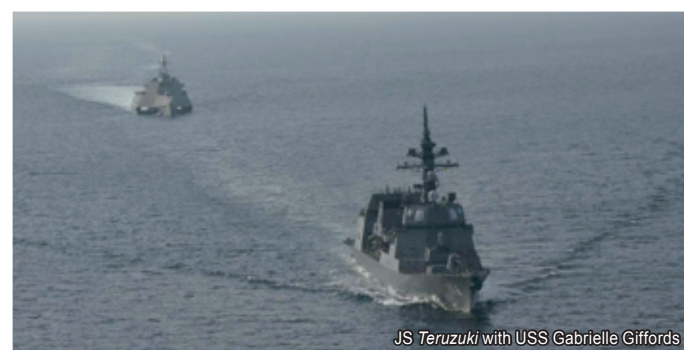
JS Teruzuki with USS Gabrielle Giffords

Approx. 260 personnel including 58 graduates who completed the 72nd aviation officer candidate course are participating in this training, which was designed to train them through various types of training on vessel operations (ship handling, firefighting, water tight, replenishment at sea, etc.) and tactical training (anti-submarine warfare and anti-air warfare, etc.).