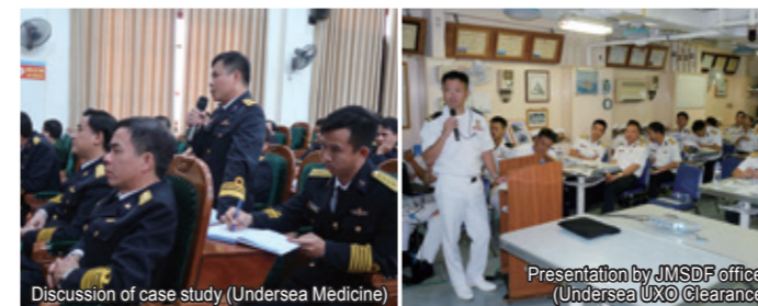
Discussion of case study (Undersea Medicine)

For instance, Japan held the fourth iteration of its Air Rescue Seminar in Vietnam on March 10th, 2020, in which the Japan Air Self-Defense Force (JASDF) personnel gave lectures on procedures for air rescue and other topics to Vietnam People's Air Force officials.