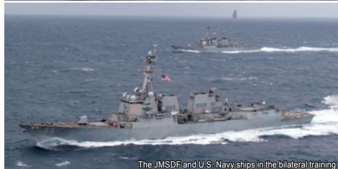
The JMSDF and U.S. Navy ships in the bilateral training