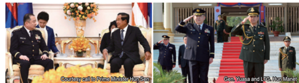
Courtesy call to Prime Minister Hun Sen

Through these courtesy calls and meetings, the Cambodian Government and the RCAF expressed great appreciation for the capacity building program by the JGSDF and the human resource development through the acceptance of Cambodian students. They also confirmed that these support initiatives should continue in the future.