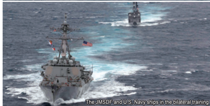
The JMSDF and U.S. Navy ships in the bilateral training