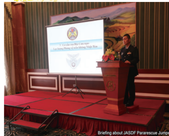
Briefing about JASDF Pararescue Jumper