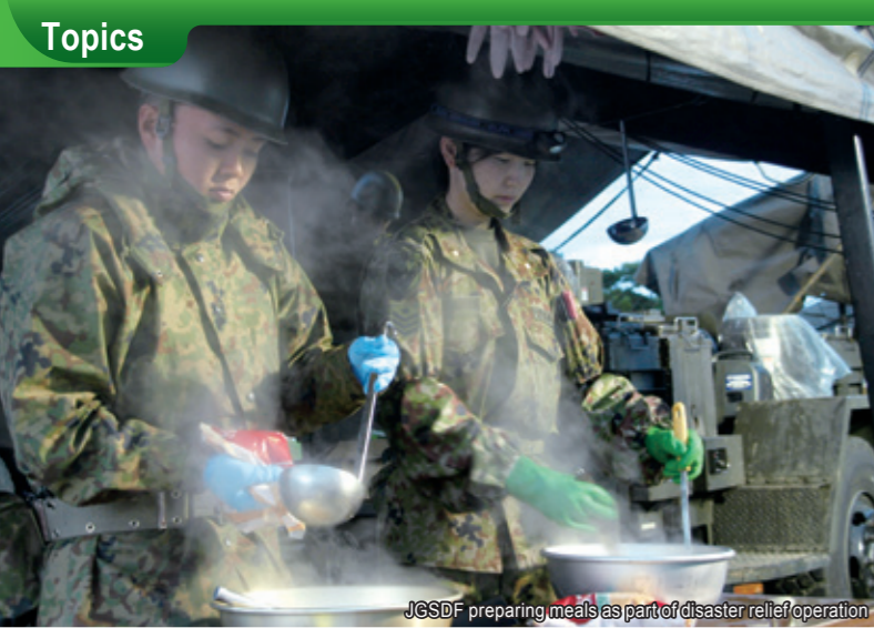
JGSDF preparing meals as part of disaster relief operation