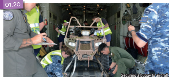
Securing a buggy to aircraft