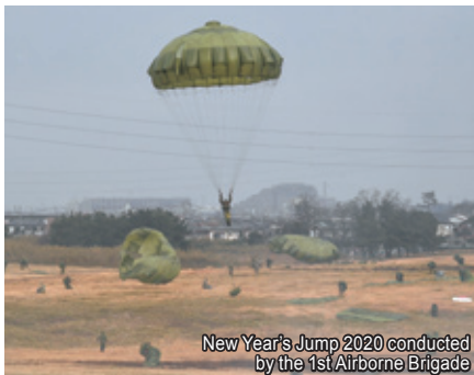
New Year's Jump 2020 conducted by the 1st Airborne Brigade

On January 12th, the 1st Airborne Brigade held New Year's Jump 2020 at the JGSDF Camp Narashino. Minister Kono observed the event. It included parachute drop demonstrations with the participation of the U.S. unit in commemoration of the event, and ground demonstrations. Minister Kono jumped from a parachute tower to experience the unit's training.