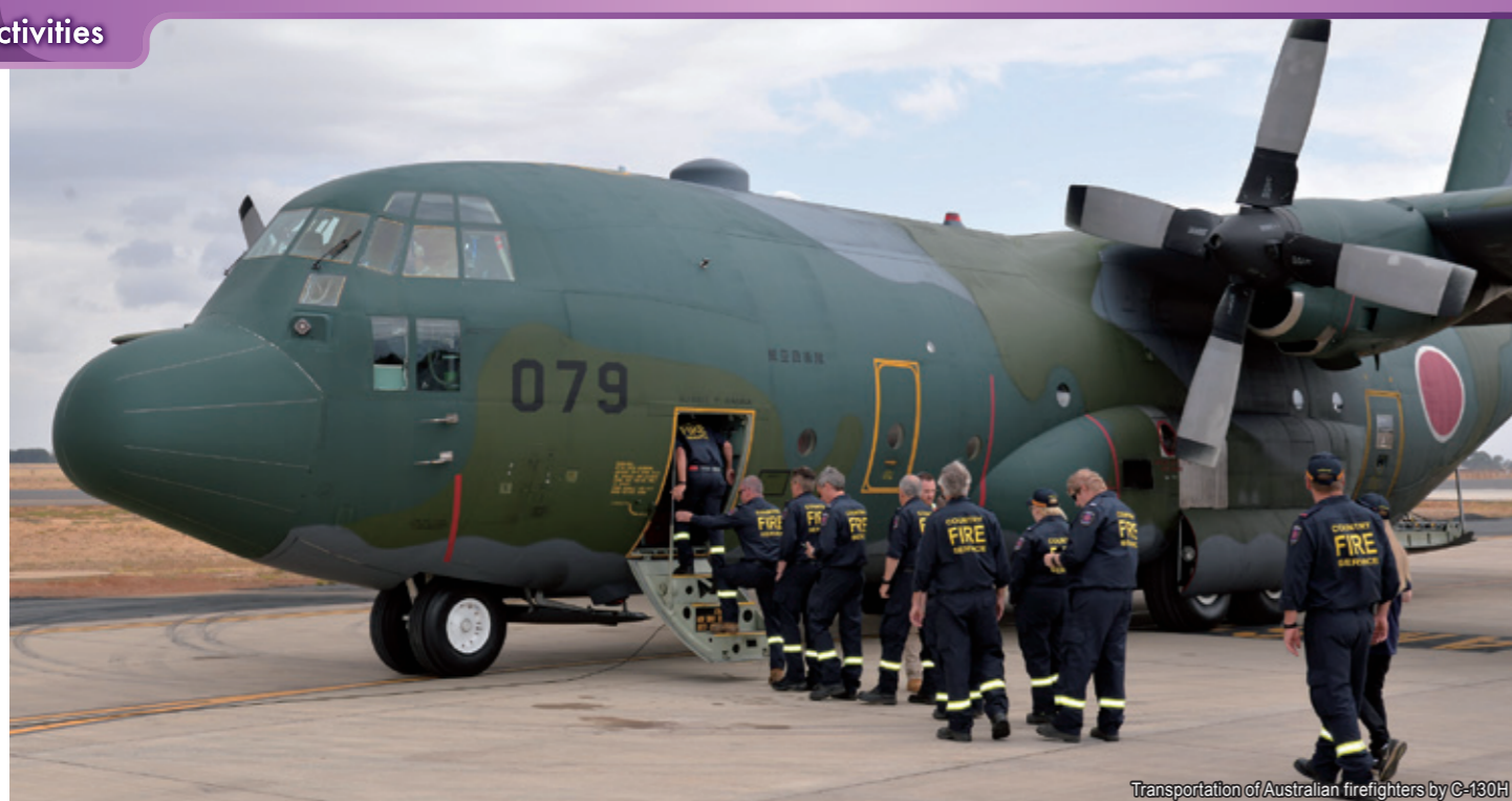
Transportation of Australian firefighters by C-130H