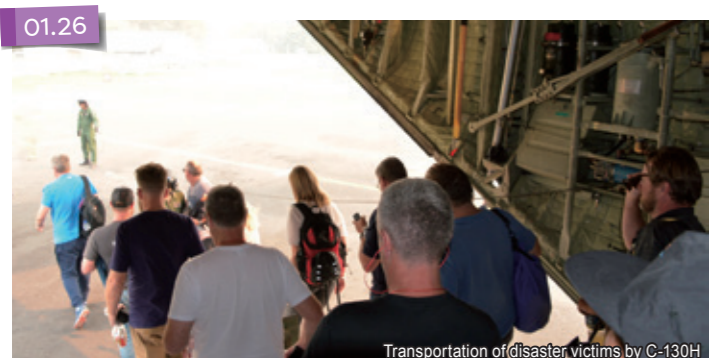
Transportation of disaster victims by C-130H