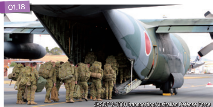
JASDF C-130H transporting Australian Defense Force

This is the first time that the MOD/JSDF has conducted international disaster relief activities at the request of Australian government. One of the dispatched personnel told the media, "We received a great deal of support from the Australian Defence Force after the Great East Japan Earthquake, so I want to do my utmost to repay for the support as part of this mission."