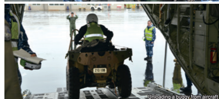
Unloading a buggy from aircraft