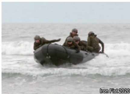
Iron Fist 2020

It is the first time for the 2nd Amphibious Rapid Deployment Regiment, established in the end of JFY 2018 as a subordinate unit of Amphibious Rapid Deployment Brigade, to participate in the exercise. The unit is conducting training on amphibious operations utilizing vast training areas in the U.S.