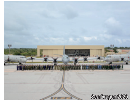
Sea Dragon 2020

One P-3C fixed-wing patrol aircraft and approximately 30 personnel were dispatched to conduct the anti-submarine warfare training with the U.S. Navy and other participating navies.