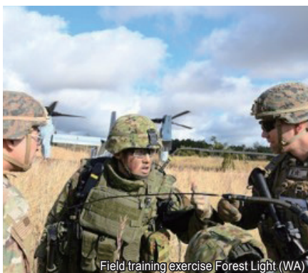
Field training exercise Forest Light (WA)

From January 18th to 30th, the JGSDF conducted field training exercise Forest Light (WA) with the U.S. Marine Corps in Japan. Using training areas in Kyushu, the JGSDF and the U.S. Marine Corps worked to strengthen cooperation and to enhance response capabilities on bilateral operations.