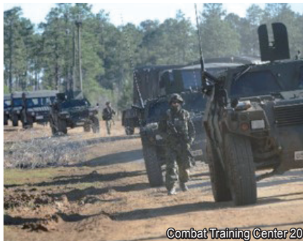
Combat Training Center 20

The JGSDF 39th Infantry Regiment and 9th Division participated in the exercise to improve bilateral response capabilities between Japan and the U.S. by training mutual coordination.