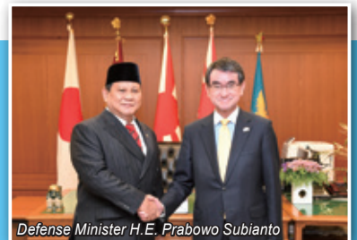
Defense Minister H.E. Prabowo Subianto