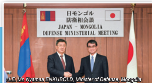
H.E. Mr. Nyamaa ENKHBOLD, Minister of Defense, Mongolia