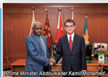
Prime Minister Abdoukader Kamil Mohamed