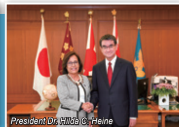
President Dr. Hilda C. Heine