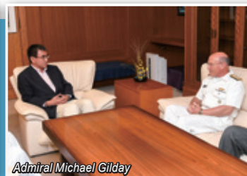
Admiral Michael Gilday