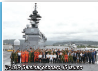
HA/DR Seminar onboard JS Izumo