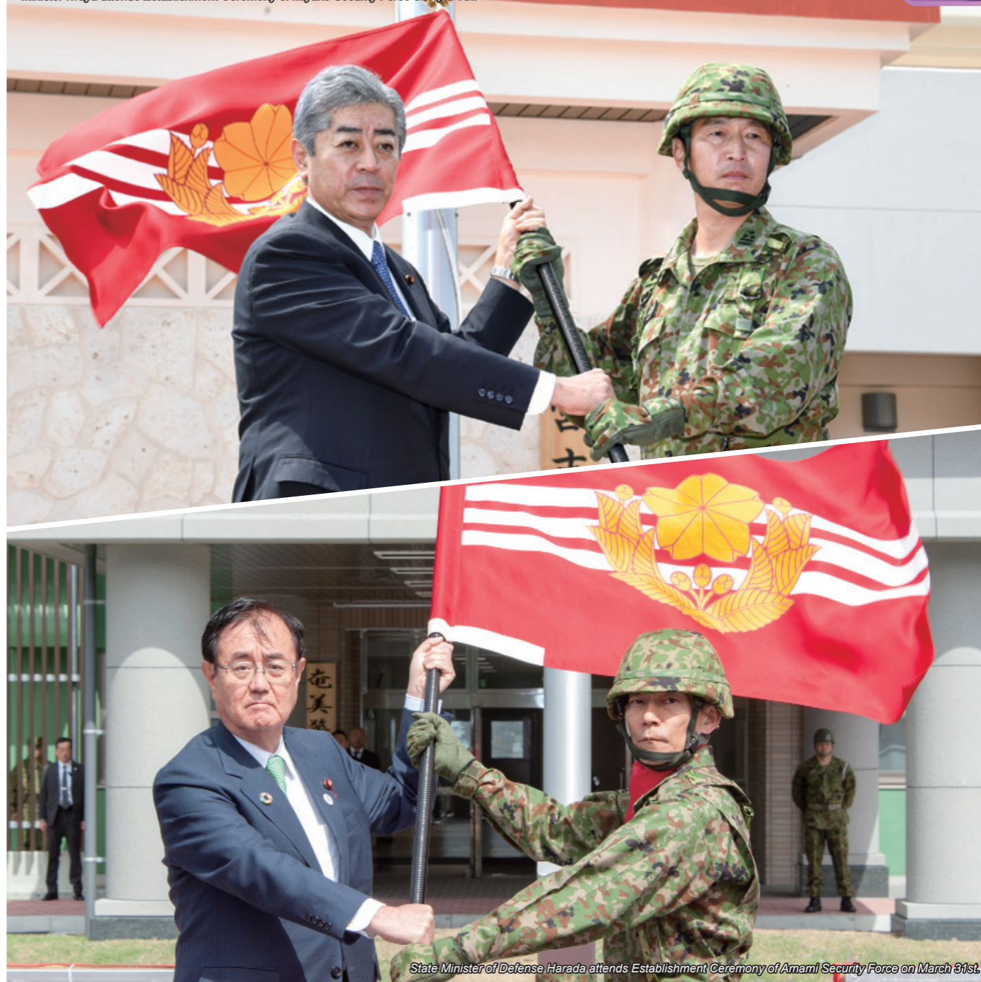
State Minister of Defense Harada attends Establishment Ceremony of Amami Security Force on March 31st.