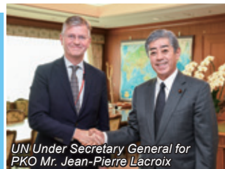
UN Under Secretary General for PKO Mr. Jean-Pierre Lacroix