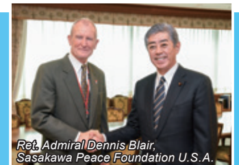
Ret. Admiral Dennis Blair, Sasakawa Peace Foundation U.S.A.