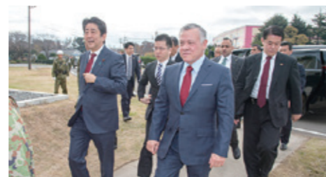
Prime Minister Abe