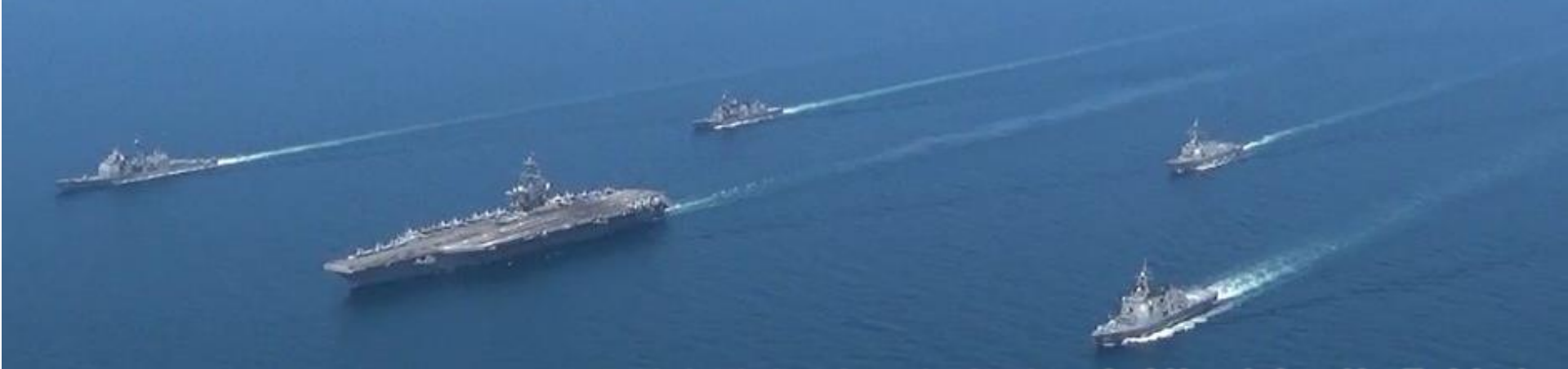
Deck Landing Training by JGSDF AH-64D & CH-47 on JMSDF Destroyer & U.S. Carrier

From April 8 to 17, 2022, all three services of JSDF (Ground/Maritime/Air) and the USS Abraham Lincoln Carrier Strike Group conducted practical bilateral exercises in the Sea of Japan, East China Sea, etc