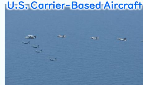
* Photo taken in PHOTO EX by the JASDF and the U.S. aircraft

With extremely frequent ballistic missile launches by North Korea, attempts to change the status quo by China in the East China Sea including the area around the Senkaku Islands, and activities by Russian forces, the security environment surrounding Japan is becoming increasingly severe. These exercises demonstrated that Japan and the U.S. have thoroughly prepared to deter unilateral attempts to change the status quo through coercion and to destabilize the region.