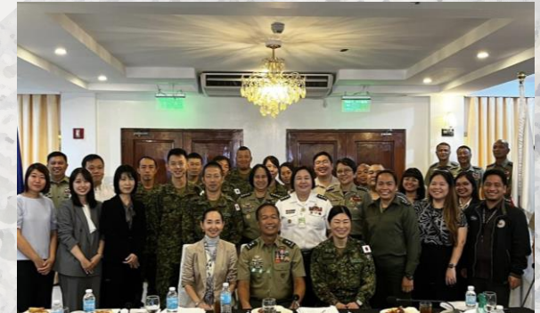
WPS Forum in Japan-Philippines HA/DR Capacity Building Program (September, 2024)