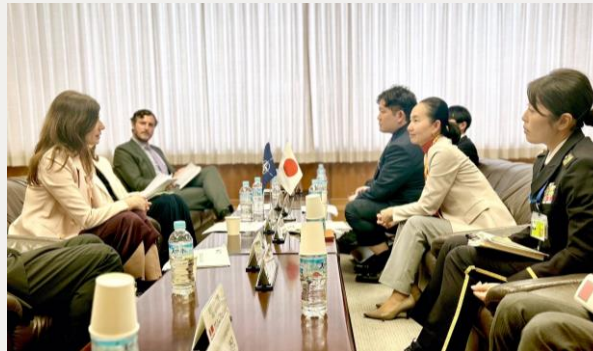
Dialogue with NATO Secretary General WPS Special Representative (May, 2024)