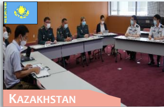
KAZAKHSTAN Military medicine

Note: Highlighted activities have incorporated WPS element