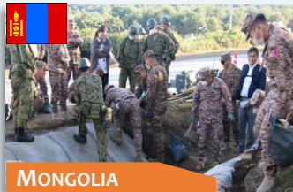
MONGOLIA HA/DR(military medicine), PKO (engineering)