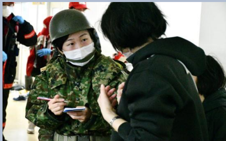
Female SDF personnel surveying needs