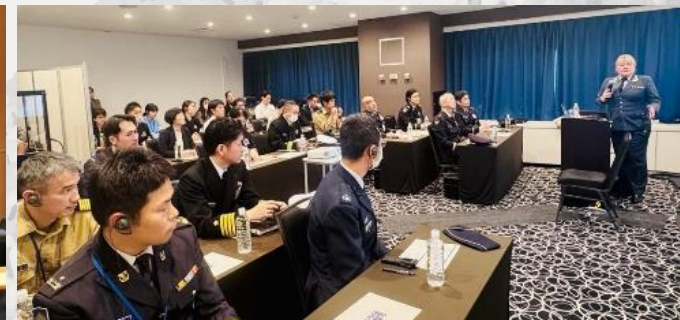
WPS lecture for JSDF personnel by Nordic Centre for Gender in Military Operations' instructor (October, 2024)