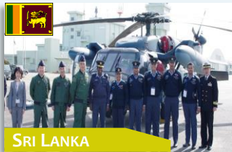
SRI LANKA Air rescue