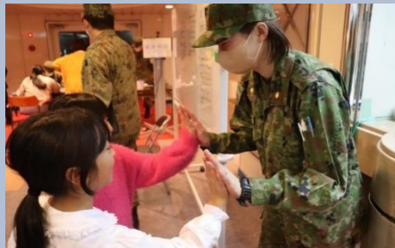
Female SDF personnel communicating with girls