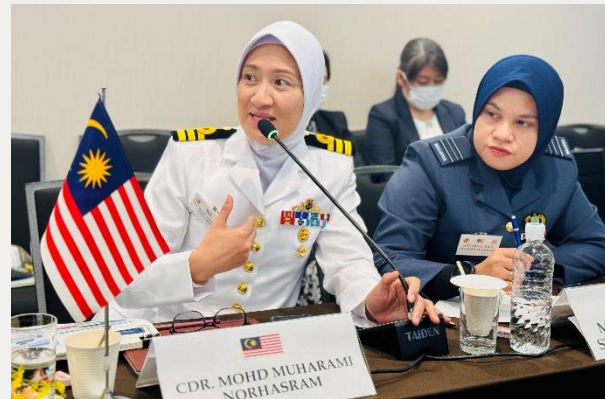
Presentation by participating countries