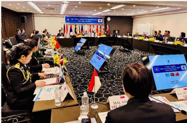
Interactive dialogue among participants