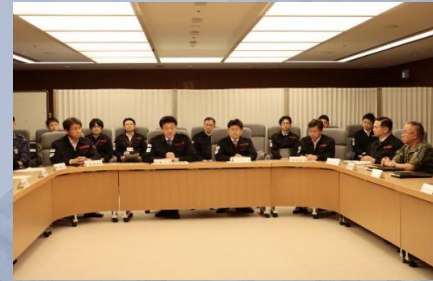
Minister, SM and PVM at JXR Disaster Response HQ