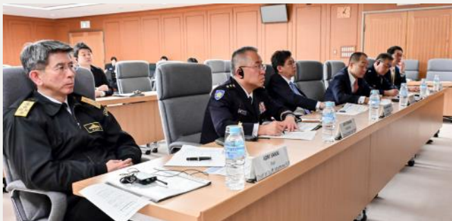
WPS Seminars for JMOD Senior Officials (March, 2024)