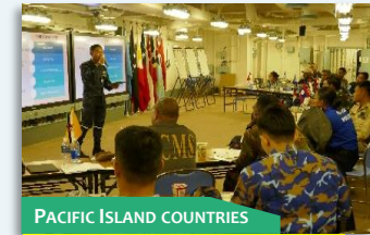
PACIFIC ISLAND COUNTRIES