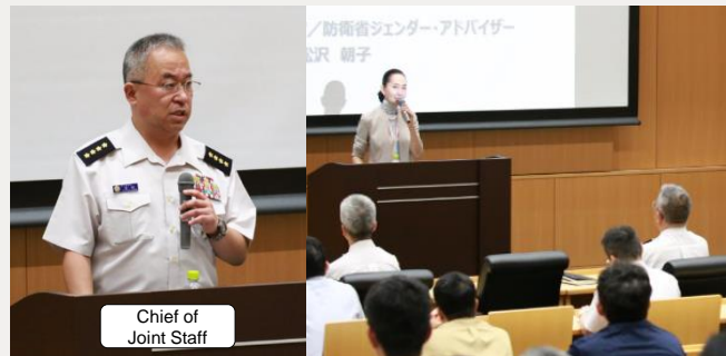
WPS training for Joint Staff personnel (June, 2024)