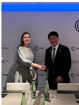
Courtesy call to Lithuanian Minister of Defence Šakalienė