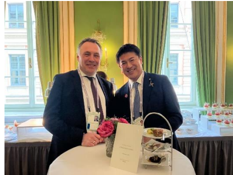
Brief discussion with Norwegian Minister of Defence Sandvic (at the luncheon hosted by German Federal Ministry of Defence)