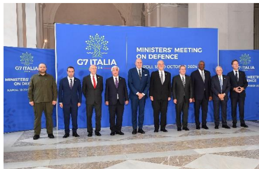
G7 Ministerial Meeting on defense