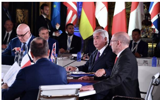
G7 Ministerial Meeting on Defense

necessary defense budget are essential for defense authorities to maximize their potential, protect national peace, and contribute effectively to regional peace and stability, and stated that we would like to continue to promote cooperation, such as sharing best practices to strengthen defense production and technology base among its ally and like-minded countries including G7, and others.