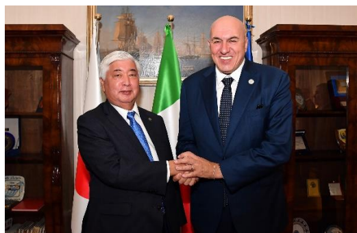
Japan-Italy Defense Ministerial Meeting

On October 18, 2024, Defense Minister Nakatani and The Hon. Guido Crosetto, Minister of Defense, held a meeting.