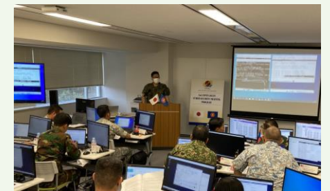
Japan-ASEAN Cyber Security Training Program for Defense Authorities (November 2023)