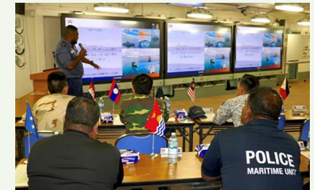
Japan-Pacific Island Countries and Timor-Leste Ship Rider Cooperation Program (August 2023)