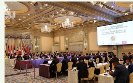
Japan-ASEAN Seminar on Climate Change and Security (March 2023)