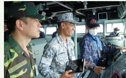
Japan-ASEAN Ship Rider Cooperation Program (August 2023)