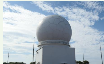
Transfer of the air surveillance radar to the Philippines (October 2023)