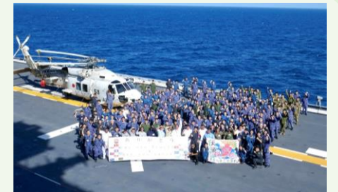
SRCP (August 2023)