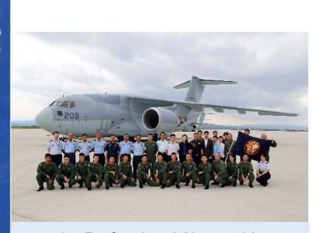
1st Professional Airmanship Program (Jul 2019)