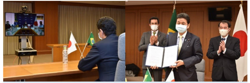
Japan-Brazil Defense Ministers' Video Teleconference and the Signing Ceremony of the Memorandum on Defense Cooperation and Exchanges (Dec 2020)

Signed the Memorandum on Defense Cooperation and Exchanges with Brazil, adding to similar memorandum with Colombia