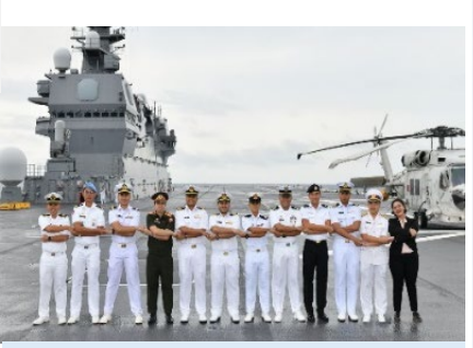
3rd Japan-ASEAN Ship Rider Cooperation Program (Jun 2019)