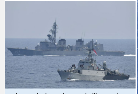
Japan-Indonesia goodwill exercise during IPD (Oct 2020)