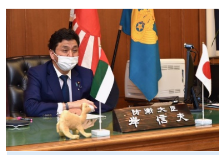
Japan-UAE Defense Ministers' VTC (Mar 2021)