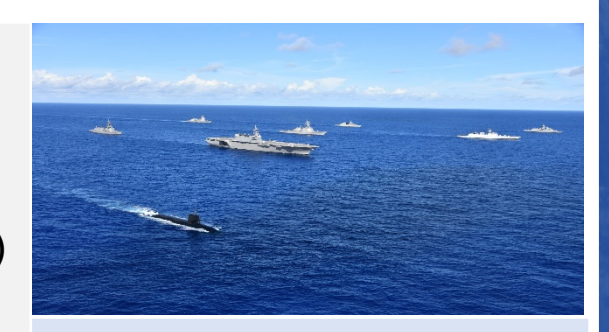
Exercise Malabar (Nov 2020)