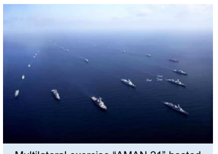
Multilateral exercise "AMAN 21" hosted by Pakistan navy (Feb 2021)