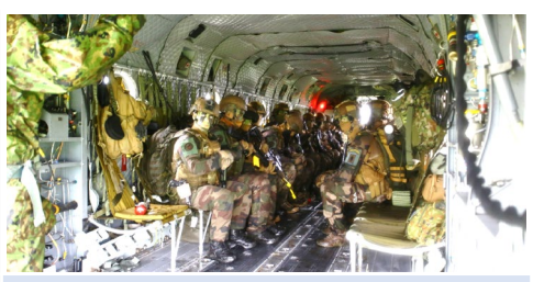
ARC21 (May 2021)