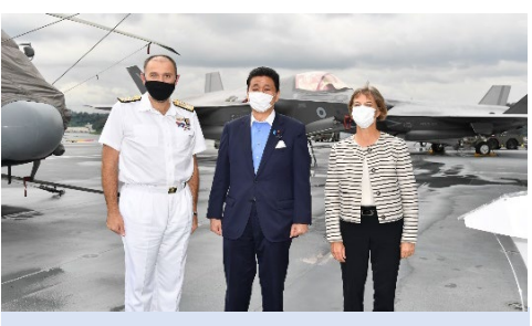
Defense Minister KISHI's visit to the UK aircraft carrier HMS "Queen Elizabeth" during a port visit in Japan (Sep 2021)