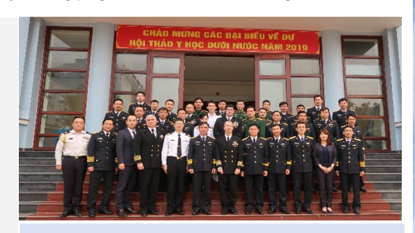
Japan-U.S. joint capacity building with Vietnam (Mar 2019)