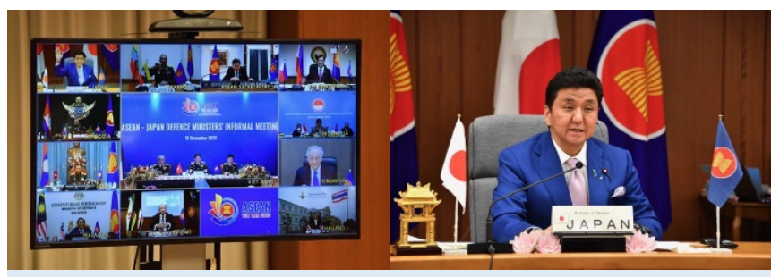
ASEAN-Japan Defense Minister's Informal Meeting (Dec 2020)

Japan's defense engagement with ASEAN is guided by the "Vientiane Vision 2.0", a commitment to enhancing defense cooperation in support of ASEAN centrality and unity