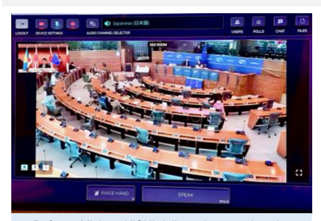
Defense Minister KISHI delivered a speech at the European Parliament (virtual format) (Jun 2021)