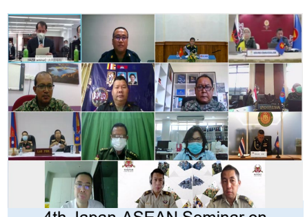
4th Japan-ASEAN Seminar on HA/DR (Online) (Apr 2021)