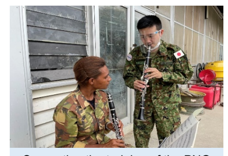
Supporting the training of the PNG military band (Sep 2021)