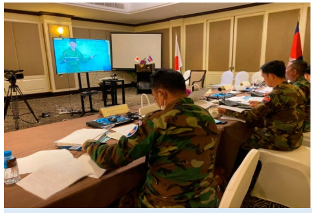
The first capacity building program held online (Cambodia) (Feb 2021)