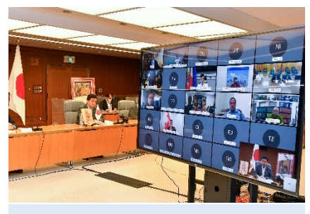
JPIDD (online) (Sep 2021)