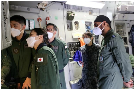
JASDF crew having a briefing of C-17