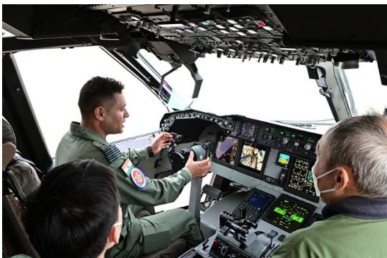
IAF pilot having a briefing of C-2