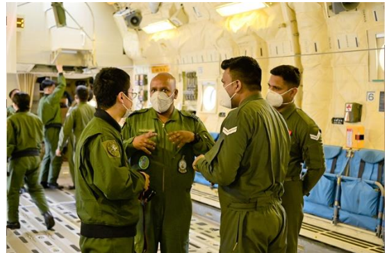
IAF crew having a briefing of C-2