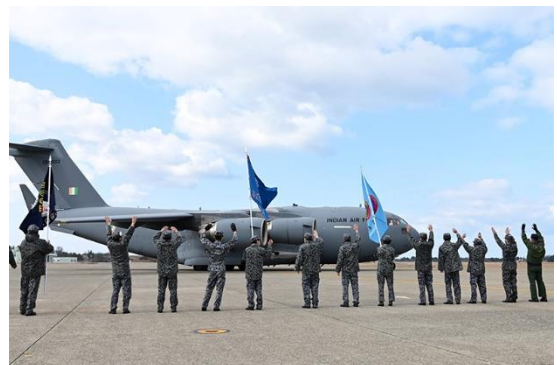
Farewell to IAF